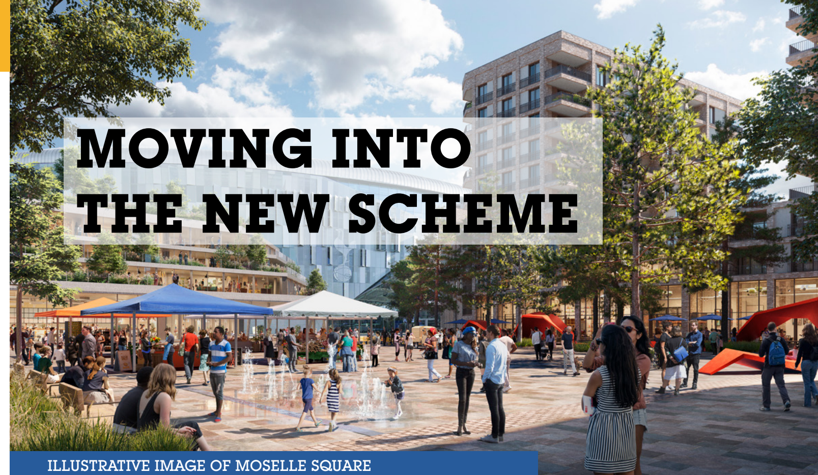
ILLUSTRATIVE IMAGE OF MOSELLE SQUARE