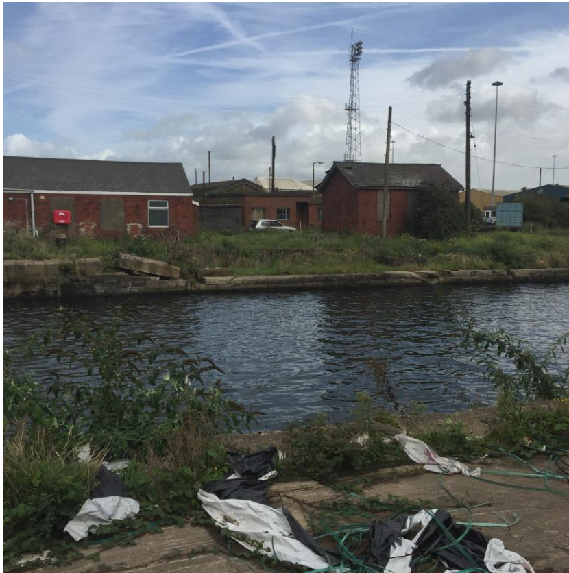
Figure 3-2 Missing Coping Stones - Junction Cut