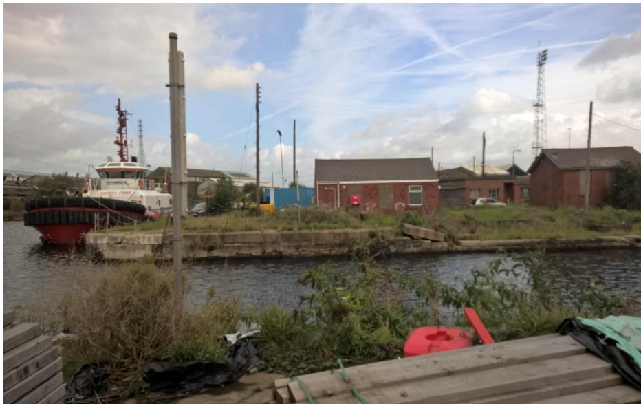
Figure 3-1 Junction Cut 29 th September 2016.

3.2.5 The width of Bird Port dock situated on the river Usk is 21.33m and the beam restriction for vessels entering the dock is 19.5m.