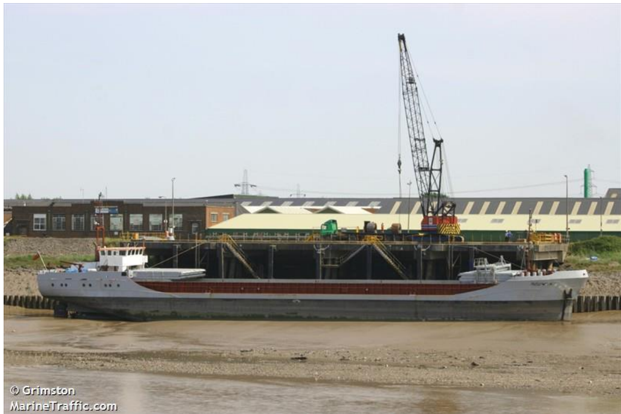
Figure 7-1 MV Douwent alongside Lysaght's Wharf on the River Usk