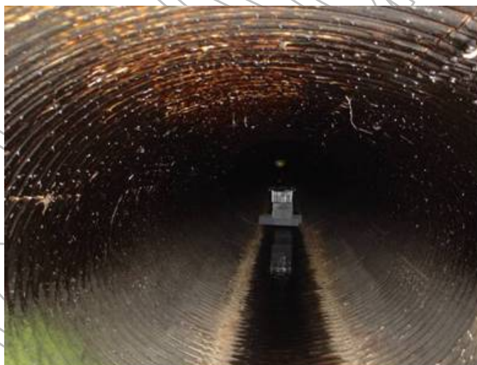
Image 5.3 Automated bat detector placed within a culvert to record bat activity. The location for these detectors may require consideration of the characteristics of the equipment being used. Ensure that equipment will not obstruct watercourse culverts. Lesser horseshoe bats are currently using this to fly underneath a dual carriageway on embankment.