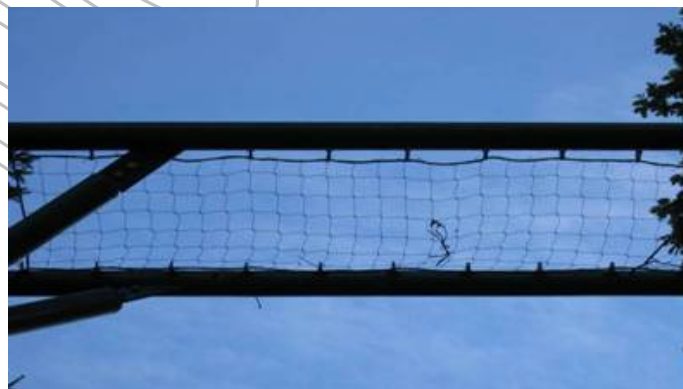
Image 8.11 A more substantial structure, consisting of mesh between metal tubes (see Image 8.12). If used in lit areas, the structure should be positioned above street lighting.