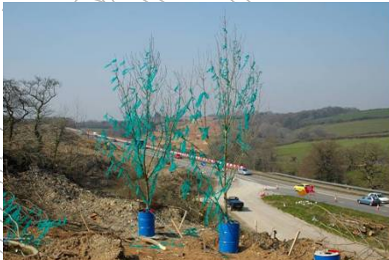
Image 8.8 Temporary mitigation Cut trees with mesh ribbon to mimic leaves placed in barrels of sand. These are easily moved and so can be cleared from the construction area during the day, being replaced before nightfall along bat flyways crossed by the working area.

If flyways are removed, temporary solutions can be used during and post construction until permanent replacements are in place or vegetation has matured (Image 8.8).