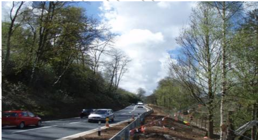
Image 8.1 Trees have been cleared on the right in order to re-stabilise the embankment. Bats were crossing the road using the canopies at this point.

Where important habitats will be temporarily affected during construction, they should be restored to a similar or better condition as part of land remediation works as soon as possible. Best landscape design practice should be used to minimise this time, for example consideration should be given to using larger tree and shrub specimens see below. In the example below, the birch and oak on the right have been planted to close the gap over the road with immediate effect to allow bats to continue to cross at this point.