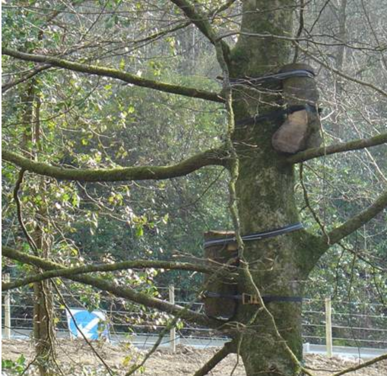
Image 8.5. Where it is safe to do so, bat roosts in hollow branches that have to be removed can be relocated to another tree by attaching with heavy duty webbing.