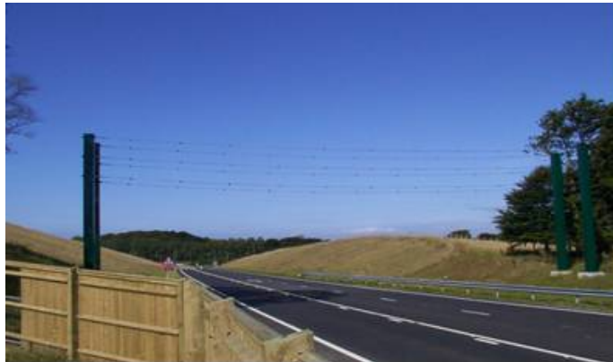
Image 8.10 Wire structure. Success is only likely to be possible if they are erected in conjunction with existing roadside trees. This example could be improved by bridging the gap to adjacent vegetation.

At the time of writing the number of examples on road network is very limited but it is hoped that the monitoring of these and several proposed structures will confirm their overall value. Prior to pursuing these structures, all other options should be examined and advice sought from the Overseeing Organisation.