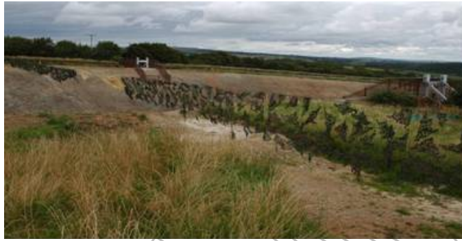
Image 8.13 Temporary structure using wire and camouflage netting constructed over a cutting during construction of a new dual carriageway to reconnect an important bat flyway.