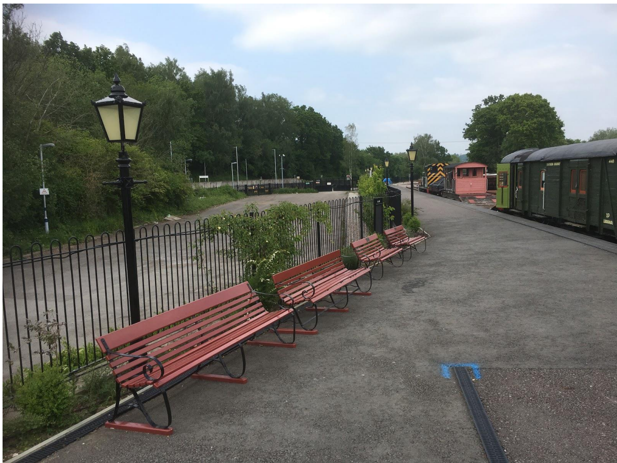
Period benches at Robertsbridge Junction Station