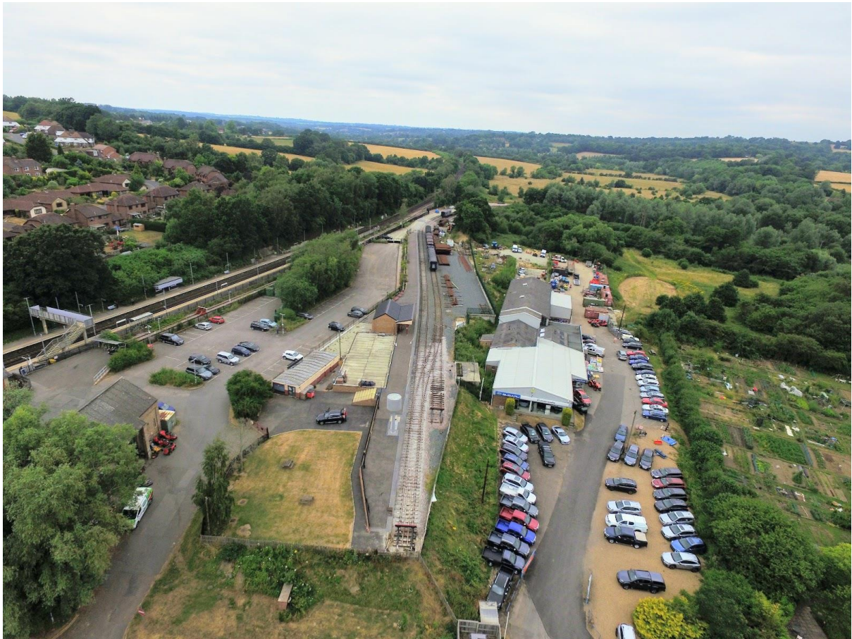
Arial view of Robertsbridge Junction Station (Centre)