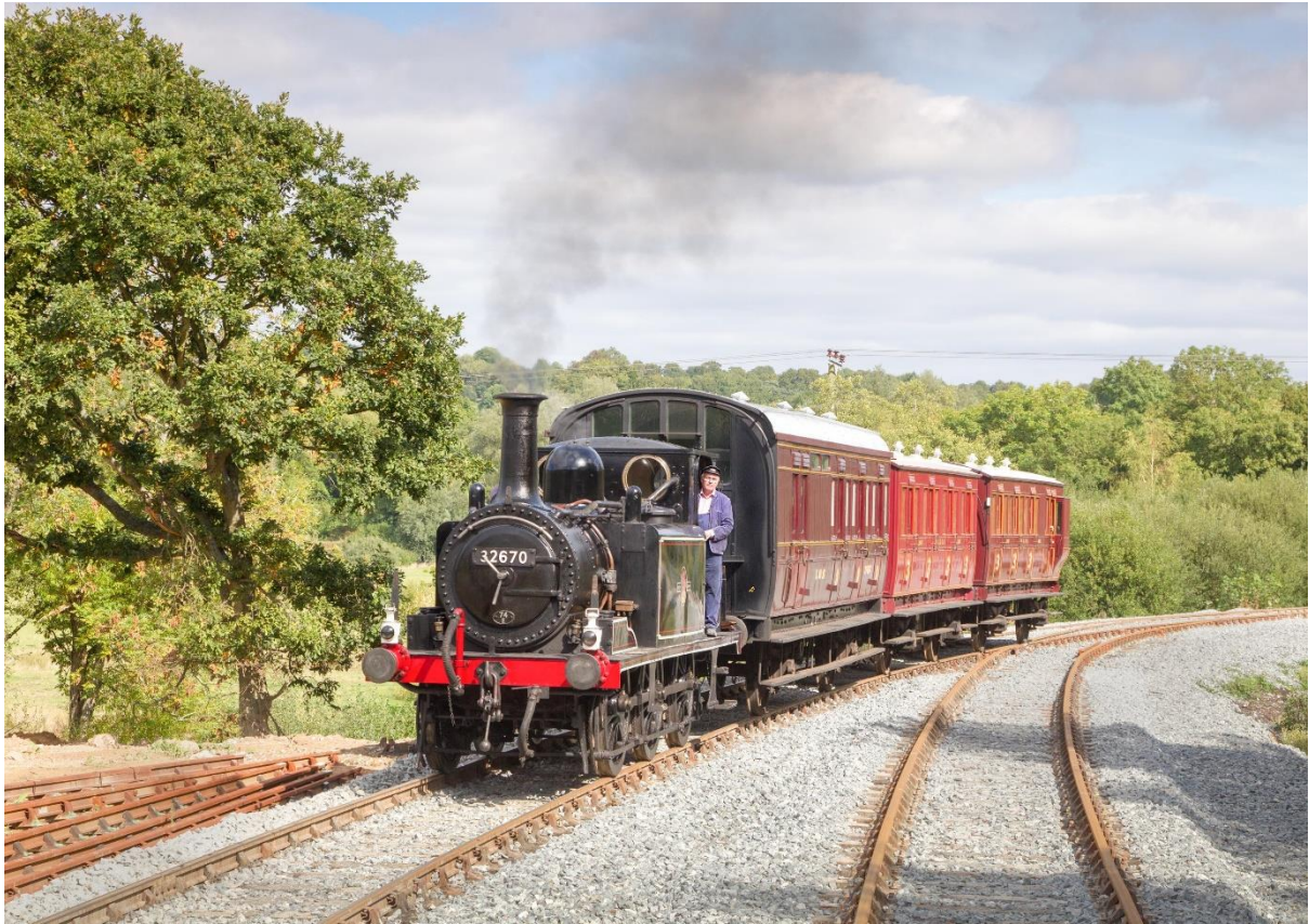
Testing the new lines