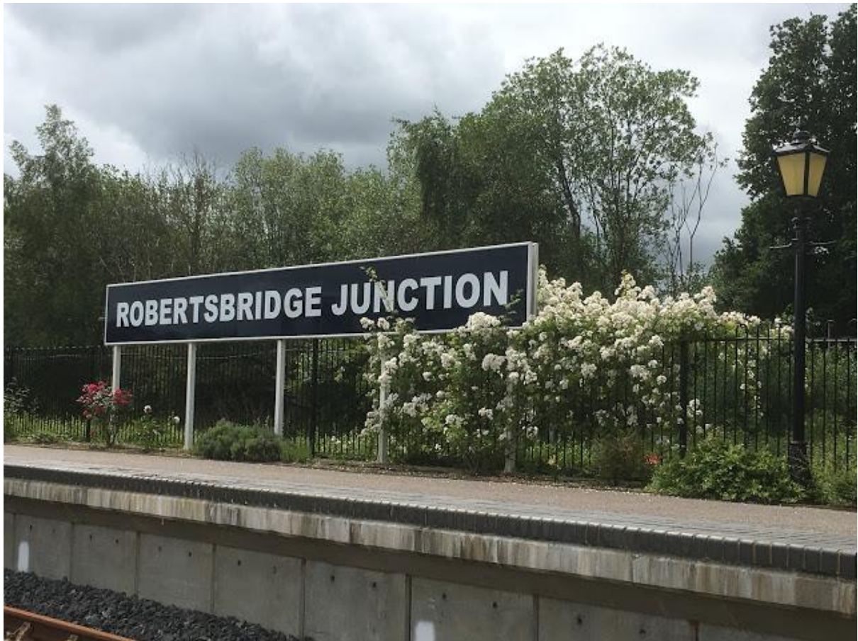
The main new platform