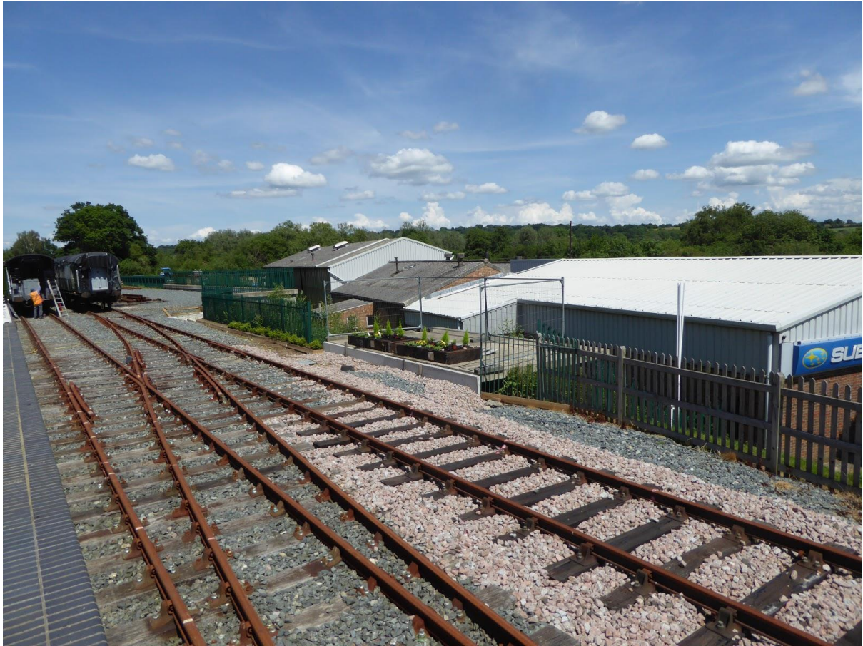
Shunting lines already constructed