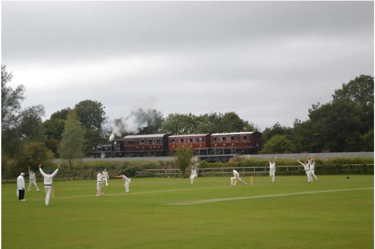
Cricketers celebrating the arrival of a train on the new RVR Tracks.