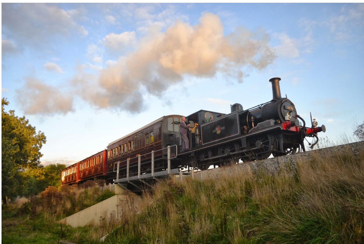
Test train passing over one of the newly constructed bridges