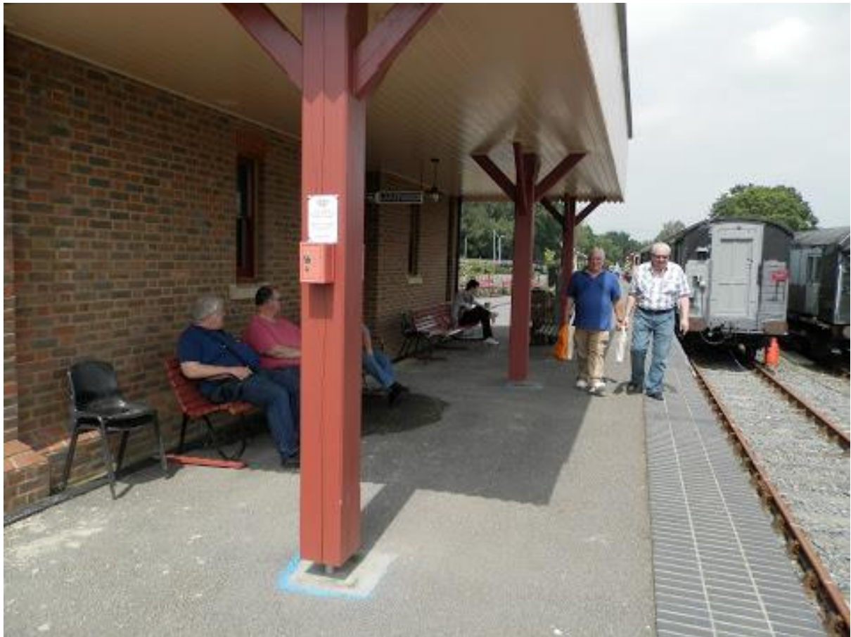
The new Station Toilet Block with visitors