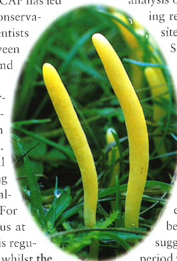
The fairy club Clavulinopsis helvola.