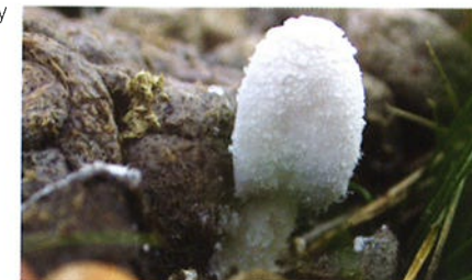
A young fruit body of the dung fungus Coprinus niveus . Gareth Griffith