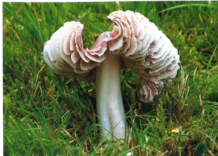
The 'pink ballerina' Hygrocybe calyptriformis.