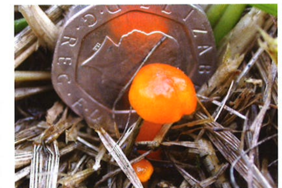
A primordium of Hygrocybe reidii.