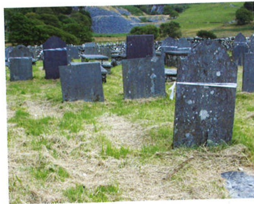
When grass clippings are left in situ they can lead to a build-up of soil nutrients.

plants to set seed but to keep the sward short towards the end of the summer, would also have a beneficial effect on mycological as well as botanical diversity.