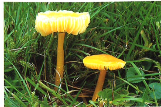
Hygrocybe chlorophana