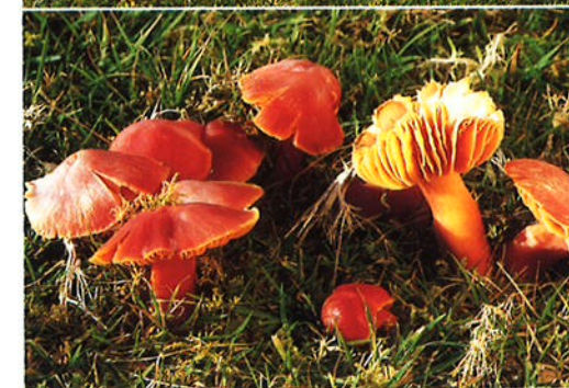
Waxcap grassland in the Preseli Hills, Pembrokeshire. Inset Hygrocybe splendidissima.