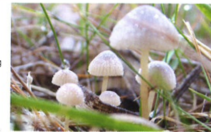
Many members of the genus Mycena are litter saprotrophs. Gareth Griffith

Mycorrhizal fungi Mycorrhizas are important in all natural ecosystems, but in grasslands it has generally been assumed that the microscopic arbuscular mycorrhizal fungi are the main players (Merryweather 2001), since ectomycorrhizal basidiomycete fungi are generally associated with woody or shrubby plants. Such hosts are largely absent from grasslands, though on calcareous grassland shrubs such as the Common Rock-rose Helianthemum nummularium can host a range of ectomycorrhizal fungi, notably Cortinarius species. Mountain Avens Dryas octopetala is associated with a diverse range of basidiomycetes. A recent and more surprising discovery is that some sedges Carex , generally viewed as non-mycorrhizal plants, can form ectomycorrhizal associations with Cortinarius cinnamomeus (Harrington & Mitchell 2002).