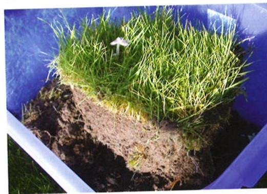
A turf containing Hygrocybe calyptriformis as part of a translocation experiment. Gareth Griffith

Data on the effects of the other main agricultural fertilisers are less clear-cut than for nitrogen. The availability of phosphorus is highly pH-dependent, and one reason for adding lime to acid grasslands is to increase the availability of phosphates for plant uptake, through increasing turnover of soil organic matter. We have found that very high levels of lime application at Sourhope (6 tonnes/ha/yr) were strongly inhibitory to waxcap fruiting. However, the effect of applications at agriculturally realistic levels (about 6 tonnes/ha in a five-year cycle) is less clear. Indeed, in one experiment on an acidic upland in Wales, fruiting of Hygrocybe conica , the only waxcap at the site, was greatly enhanced three years after lime addition (John Hedger pers. comm.).