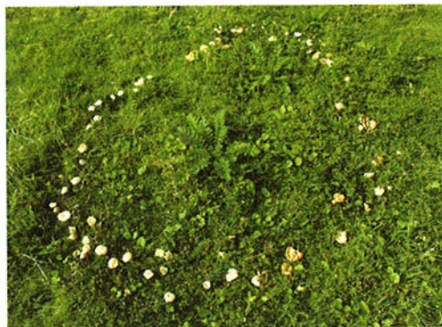
A fairy ring of Marasmius oreades .