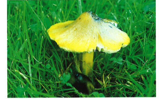
Hygrocybe conica . Paul Sterry/Nature Photographers

tors. There are several waxcaps, such as H. virginea or H. conica , which appear to be early colonisers of previously disturbed grassland and are thus often found alone. However, the relatively common H. pratensis was found by Thompson (2000) to be a good indicator of high-quality sites, since it generally co-occurred with nine or more other waxcap species. On the other hand, Newton et al. (2003) found that the best sites for waxcaps tended not to be the best ones for other CHEG species, with the best waxcap site in Scotland (Rassal, in Western Highland Region, with 27 waxcap taxa) ranked only 230th for fairy clubs out of the 621 sites surveyed.