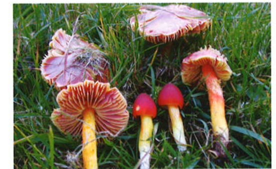
Hygrocybe punicea . Gareth Griffith

In an ongoing project funded by CCW, we are testing the use of 900m 2 quadrats, surveyed by the 'mowing method' (walking back and forth at approximately 2m intervals), either early or late in the season in two successive years. Larger sites involve more quadrats, and surveyors are also making counts of numbers of fruit bodies for each species and total number of species for each site. It is hoped that this system will provide a cost-effective