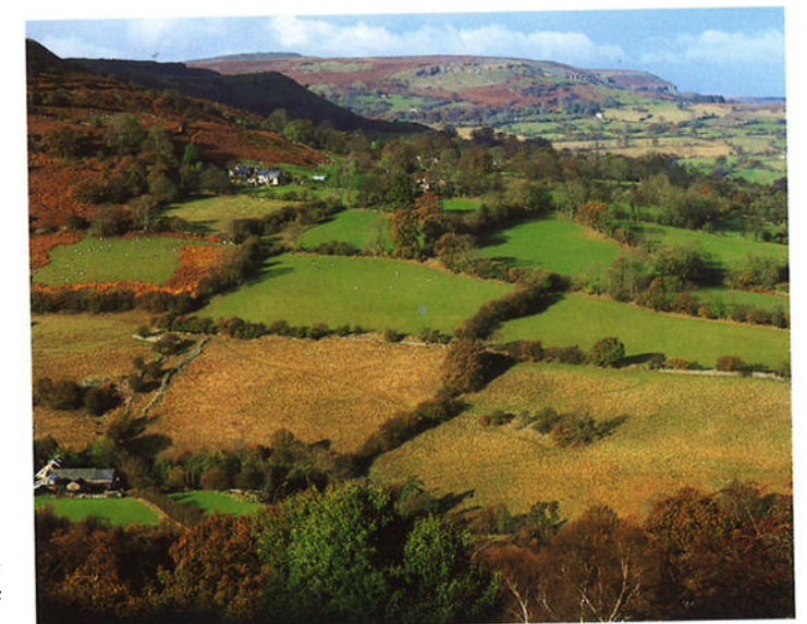
Unimproved farmland (foreground) near Abergavenny, Gwent, contains some of the top UK sites for waxcaps. Bob Gibbons

Many readers will now be wondering where all the nitrogen that threatens the waxcaps is coming from. The main natural source is fixation of atmospheric nitrogen by bacteria in the roots of legumes (1-20kg N/ha/yr). Another source is the deposition of nitrogen as ammonia or nitrous/nitric oxides. It is still not widely appreciated that nitrogen-deposition levels have increased several-fold over the past century, with the UK now receiving 5-55kg N/ha/yr. Most nitrogen deposition is anthropogenic, originating mainly from vehicle emissions and intensive animal husbandry. N-deposition levels are a significant cause for concern, particularly in the uplands of England and Wales, where high rainfall leads to deposition levels of 20-30kg N/ha/yr in areas which have historically received very low nutrient inputs. In the Netherlands, nitrogen deposition is even higher (with rates of over 100kg/ha/yr in places), and Eef Arnolds (1988) has identified this factor as the main cause of the declining yields of certain ectomycorrhizal fungi in the post-war period. It could be argued that levels