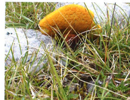
A Boletus luridus growing on Mountain Avens on the Burren in western Ireland. Gareth Griffith

America includes many species common to the UK. Waxcaps are indeed found in UK woodlands (some species, such as H. quieta , more so than others), but it is more the great abundance of grassland waxcaps in northern Europe that is so impressive. Speculation as to why this is the case ranges from reduced competition (from other fungi) in grasslands compared with woodland to Bruce Ing's suggestion that the higher summer temperature of temperate grassland soils is a significant factor.