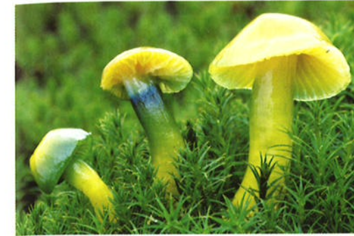
Hygrocybe psittacina .

For species read distinct morphological type. The groups shown in bold are those which are fairly unmistakable. Note that sites should not be 'written off' because of a low score; scores will be higher from mid-October onwards.