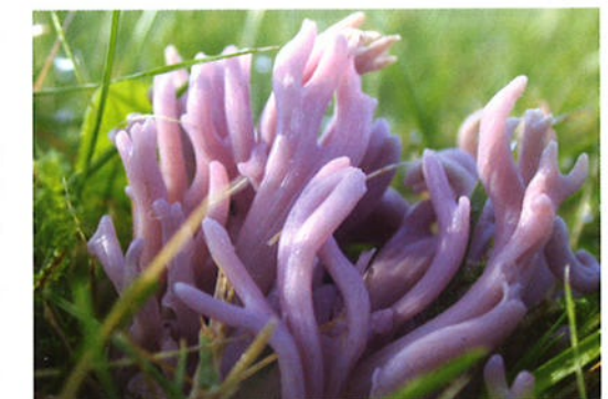
Clavaria zollingerii.