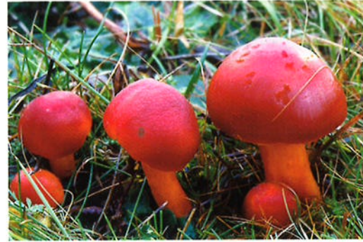
Hygrocybe coccinea . Bob Gibbons/Woodfall Wild Images

limited snapshot and, as noted by Alan Feest (2000), it is important therefore to consider survey methodology.