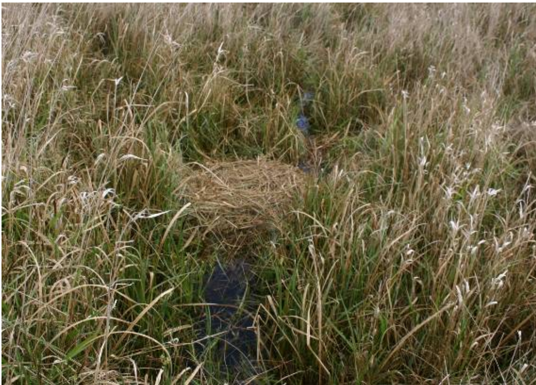
2. Legend and Elle's first attempt nest. Failed 28/04/2015.