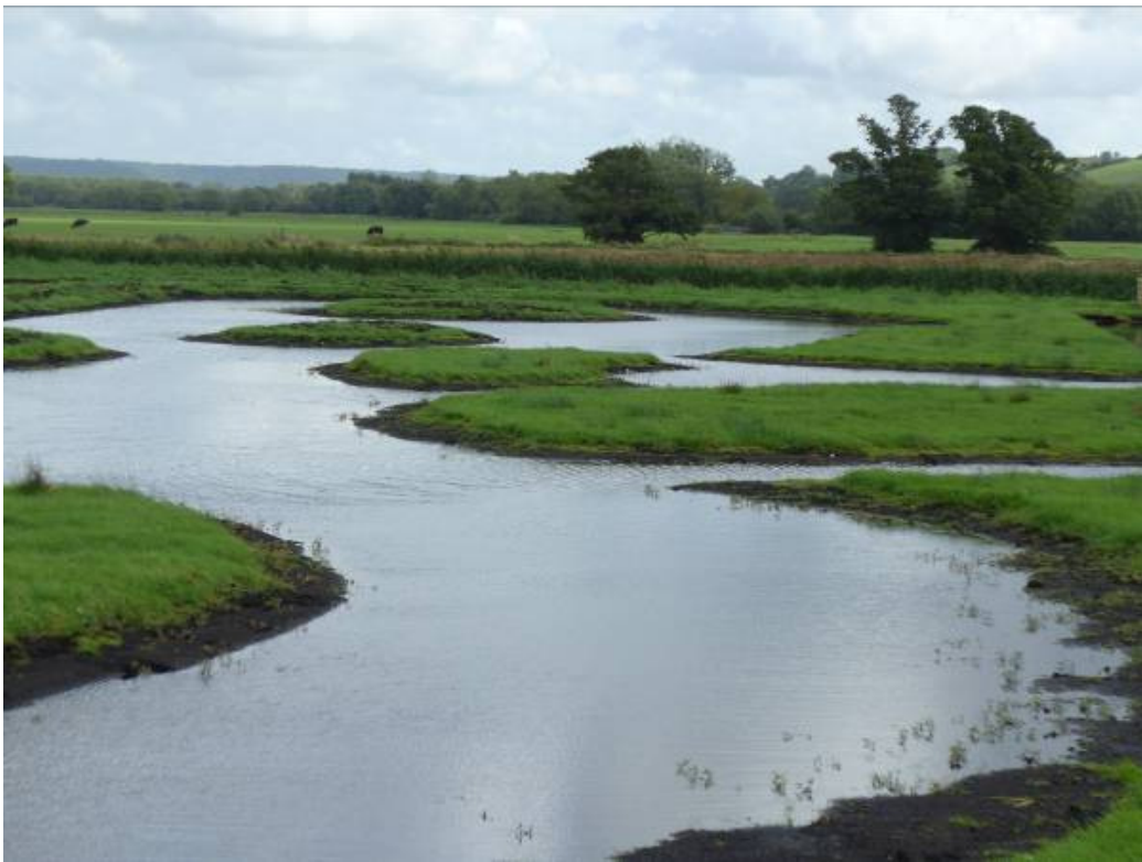
18. Newly created crane breeding zone on Kings Sedgemoor - 15/07/2015