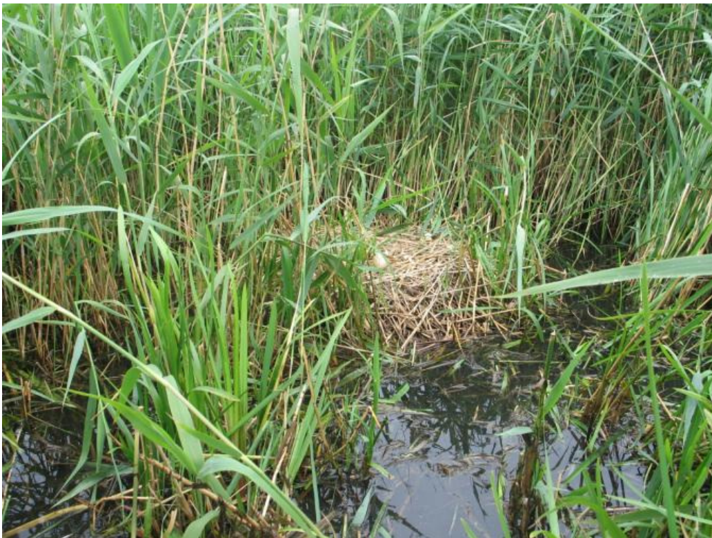
6. Wycliffe and Maple's nest in reedbed at Otmoor with predated egg in situ.