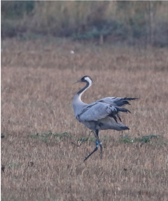
25. 26/10/2015 Haribo with back pack straps loose