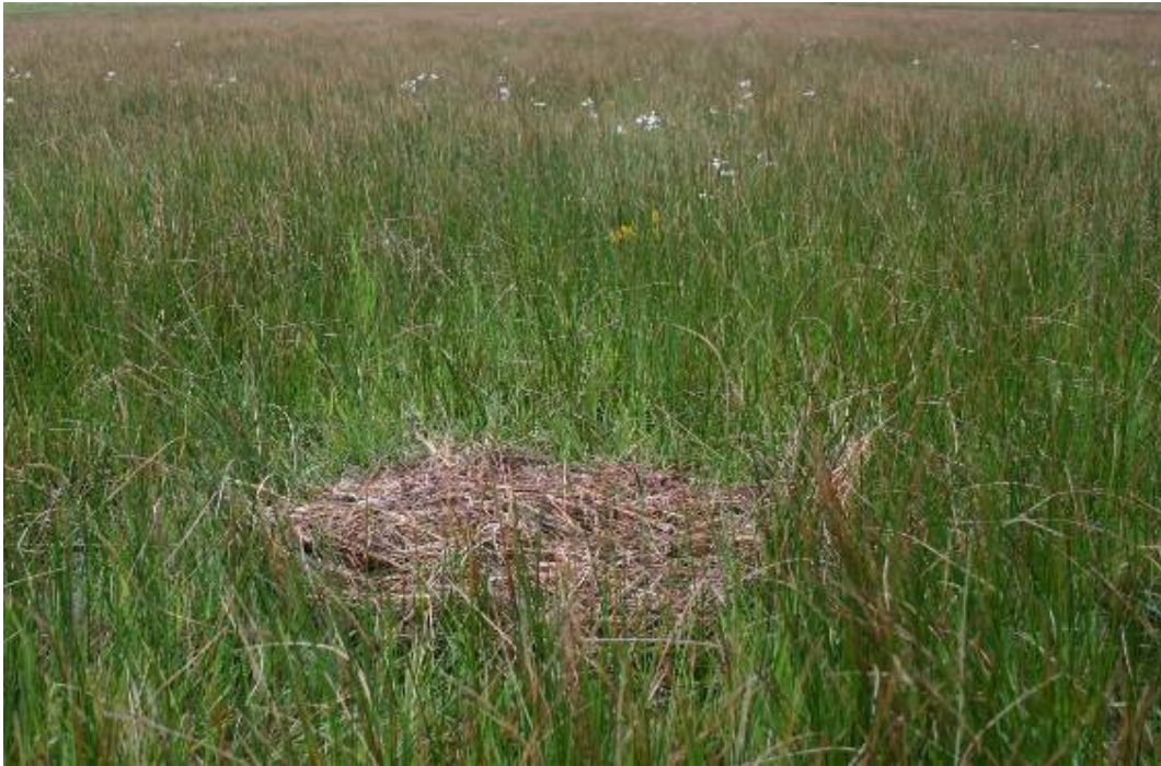
1. Timmy and Michaela's second attempt nest. Failed 04/05/2015.