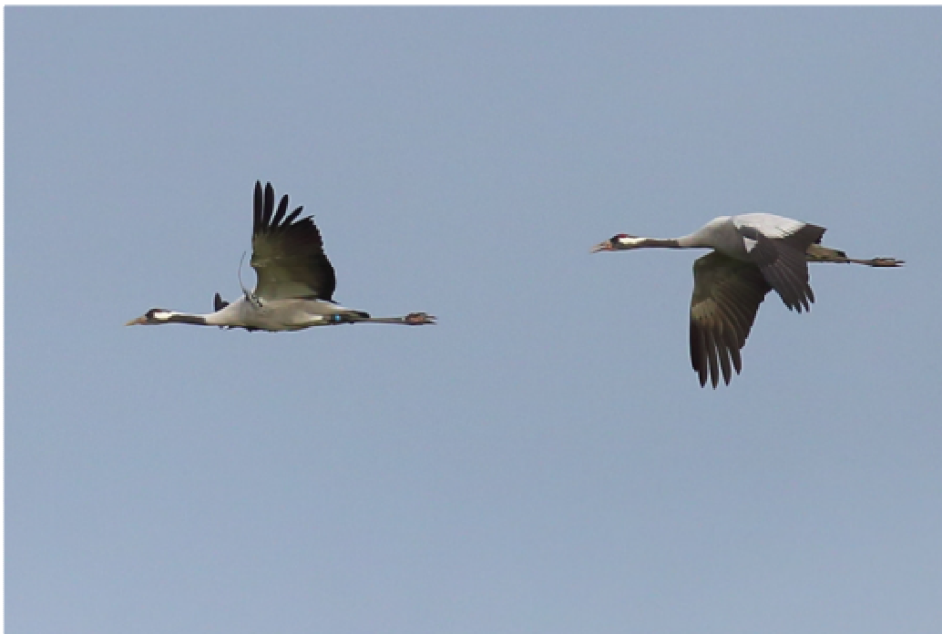
8. Elle with malpositioned back pack. 23/09/2015.