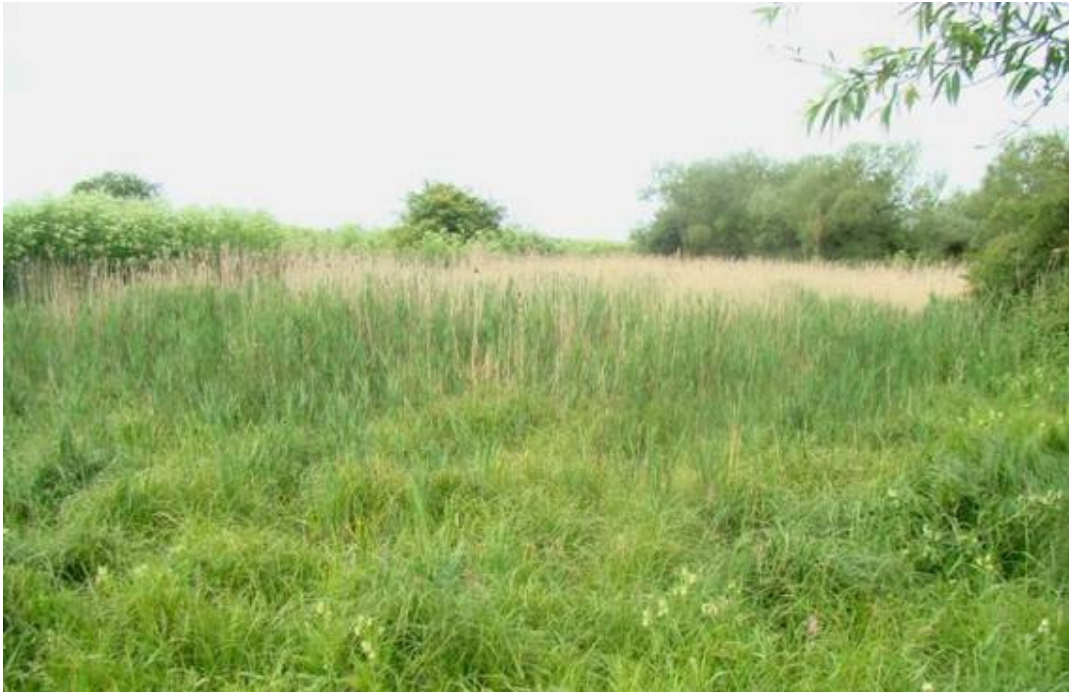
4. Reedbed site of Alexander and Swampy's nest – 10m in from near edge. Taken 16/06/2015.