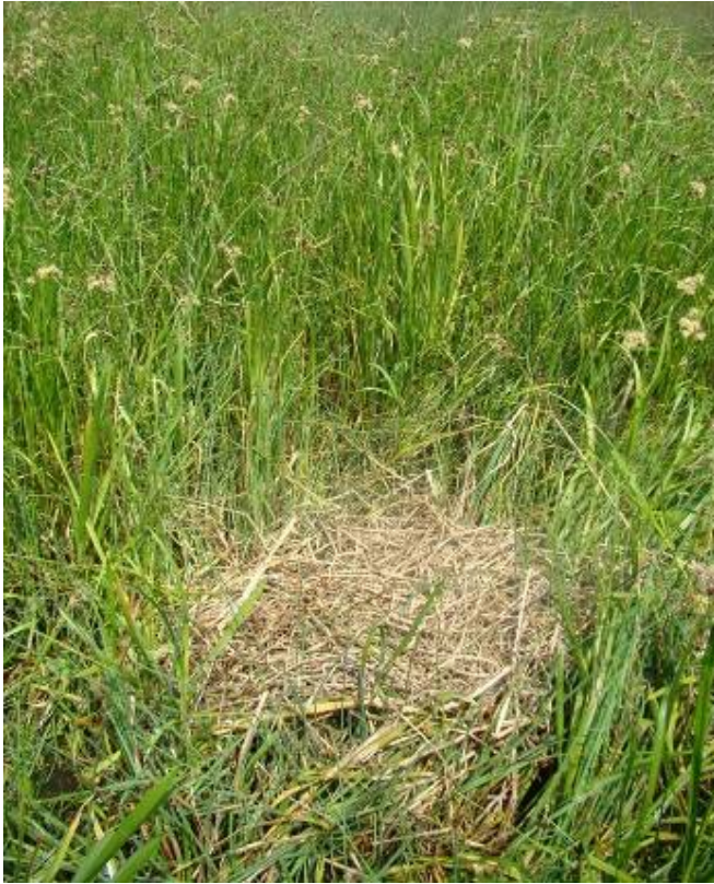
5. Likely failed nest of Gerald and Flash on West Sedgemoor - 17/06/2015.