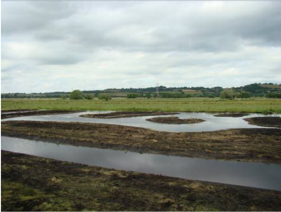
21. Newly created crane breeding zone on Moorlinch - 16/07/2015.