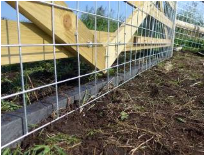
20. Close up of fox-deterrent mesh. Photo Damon Bridge.