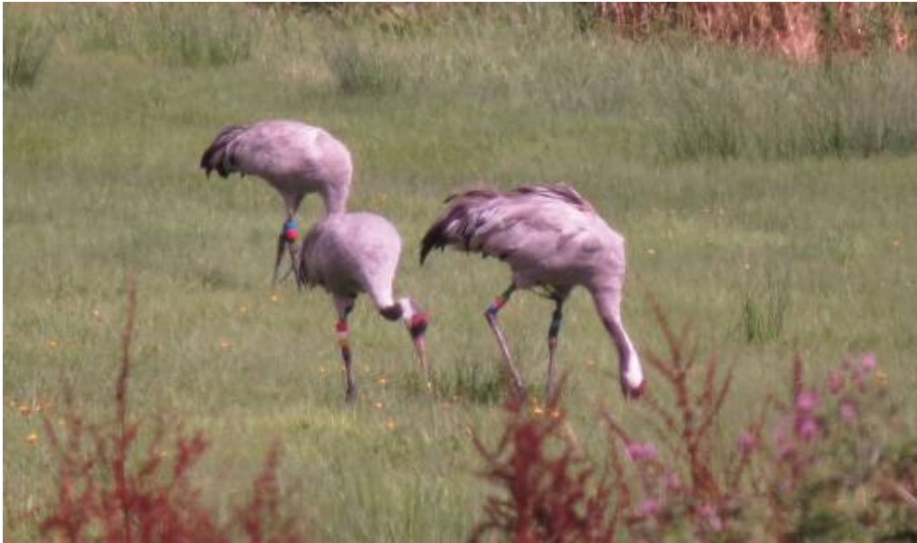
7. Shadow (bird on the right) with back-pack straps between legs 01/09/2015.