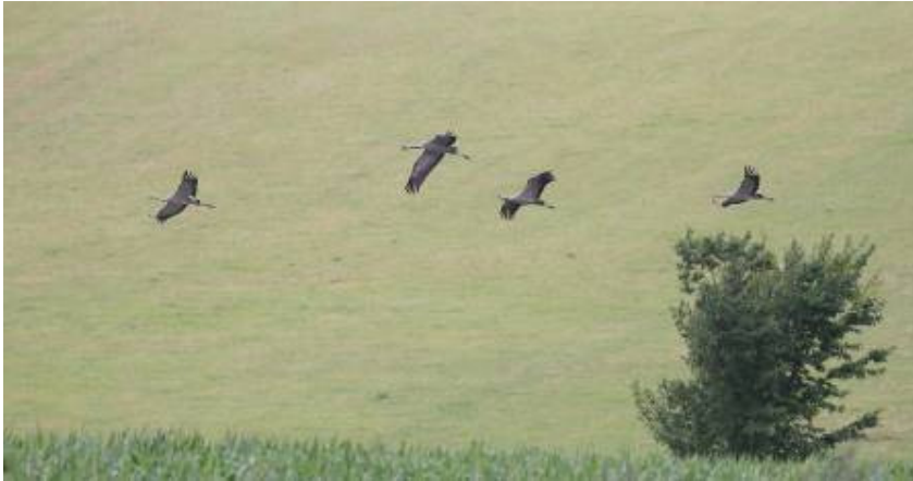
13. Both chicks flying with the adults on 27/07/2015.