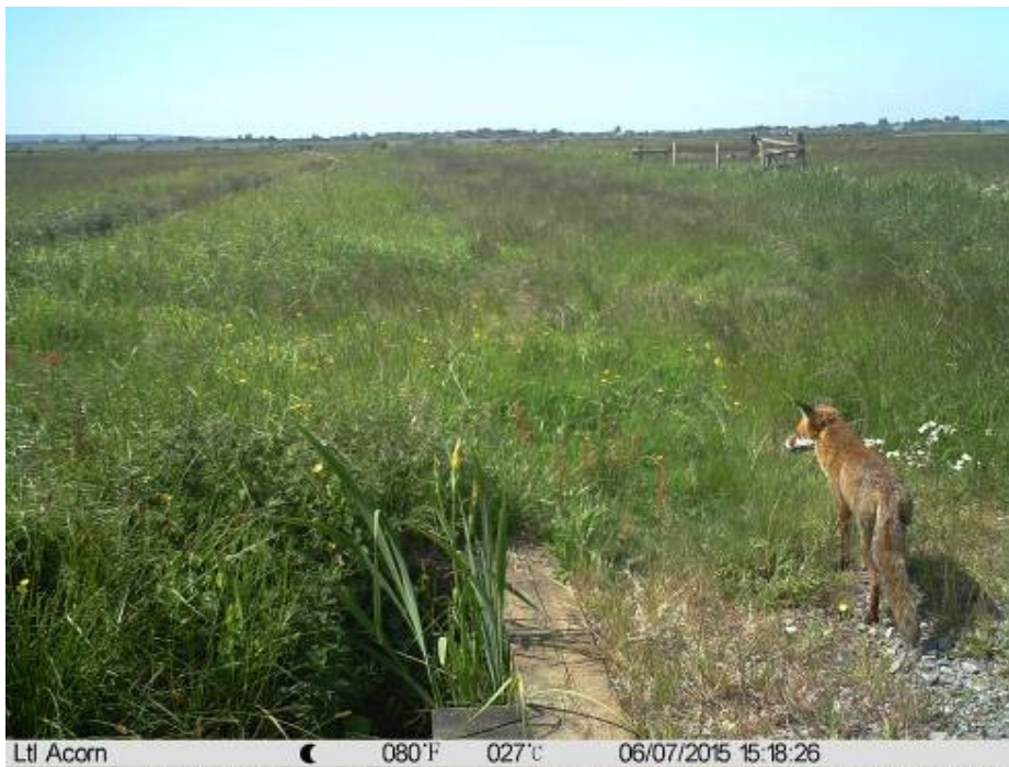
23. Train cam image of fox on drove on West Sedgemoor 07/06/2015