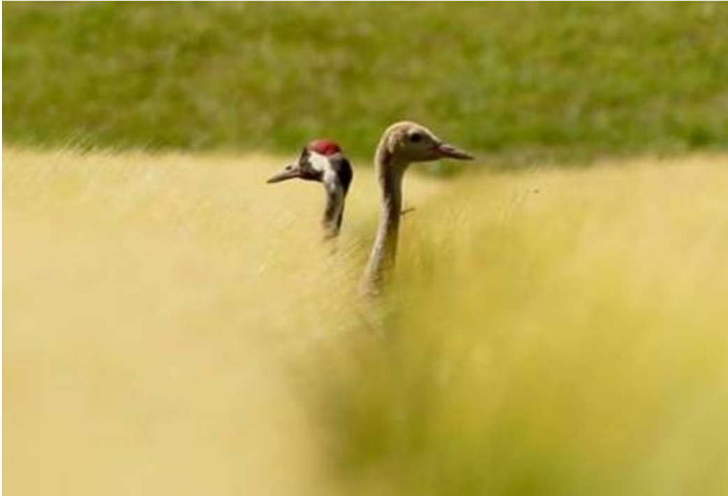
15. Minnie and Wendy's chick with either Minnie or Wendy at Slimbridge on 23/07/2015.