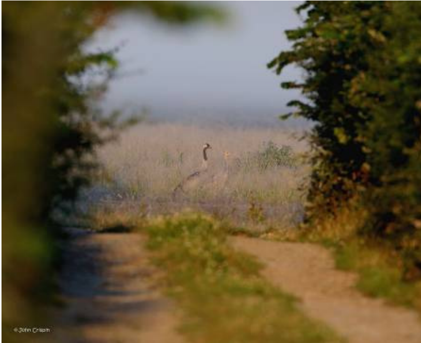
11. One of the chicks with an adult on 17/07/2015.