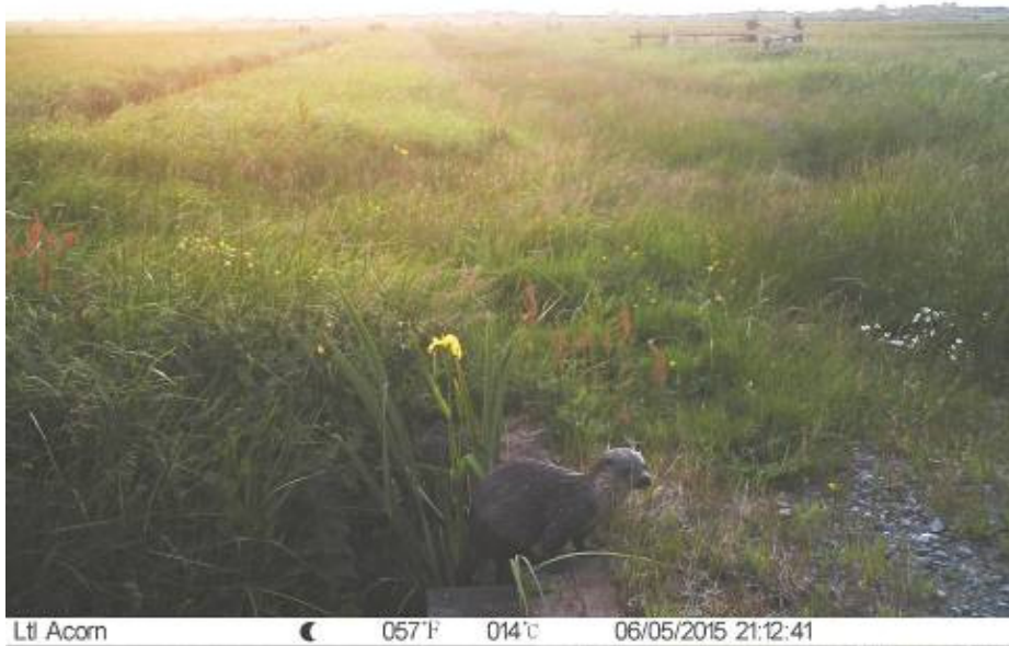
24. Trail cam image of otter on drove on West Sedgemoor 05/06/2015