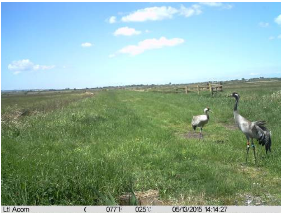
22. Trail cam imaged of Timmy & Michaela a day before starting to incubate their third clutch.