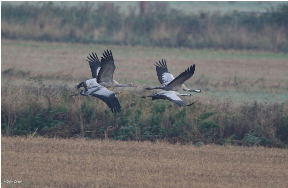
Alexander, Swampy and their two offspring – 25 th October 2015.