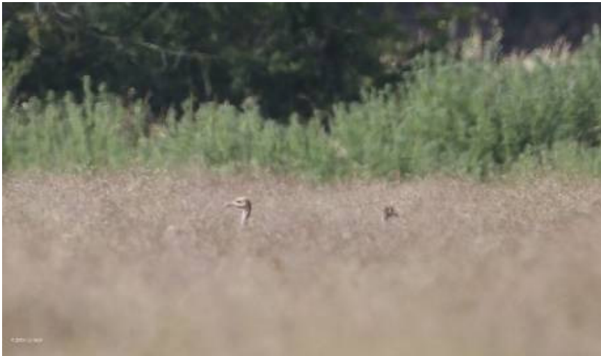
10. Alexander & Swampy's two crane chick heads in the long grass. 06/07/2015.