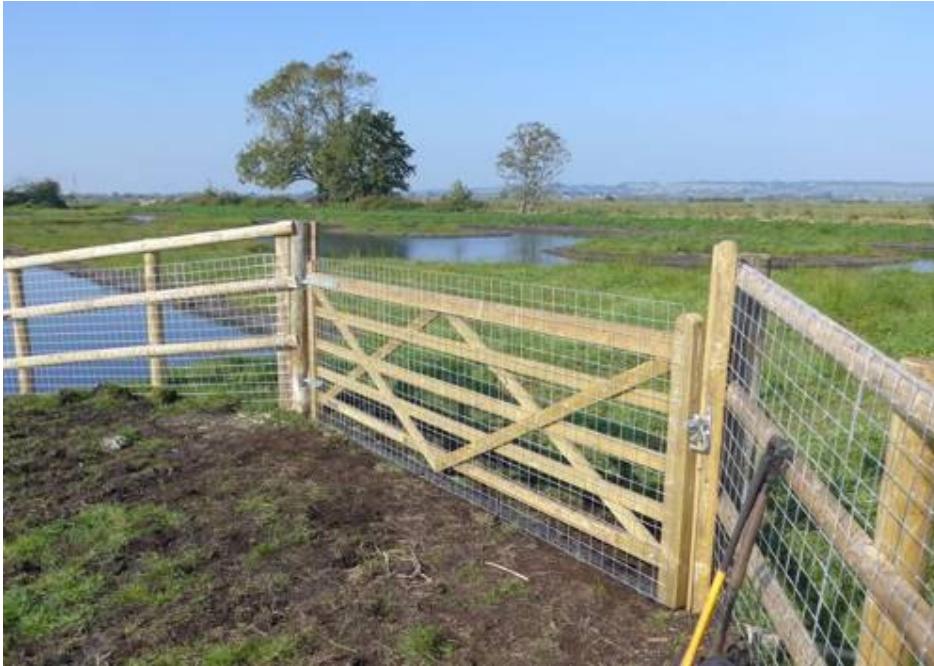
19. Fox-proof deterrent fencing installed. 02/10/2015.