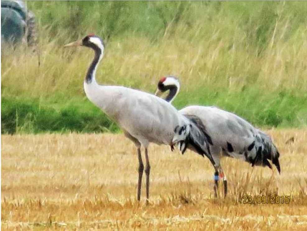
9. Beatrice at Ouse Washes, Cambridgeshire with possible (unringed) 'partner' – 23/09/2015.