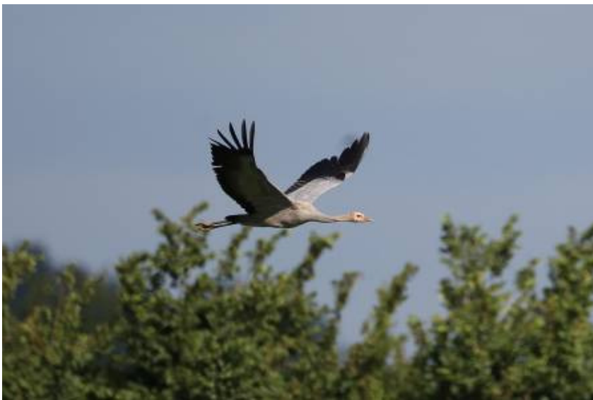
12. First seen flying on 22/07/2015.