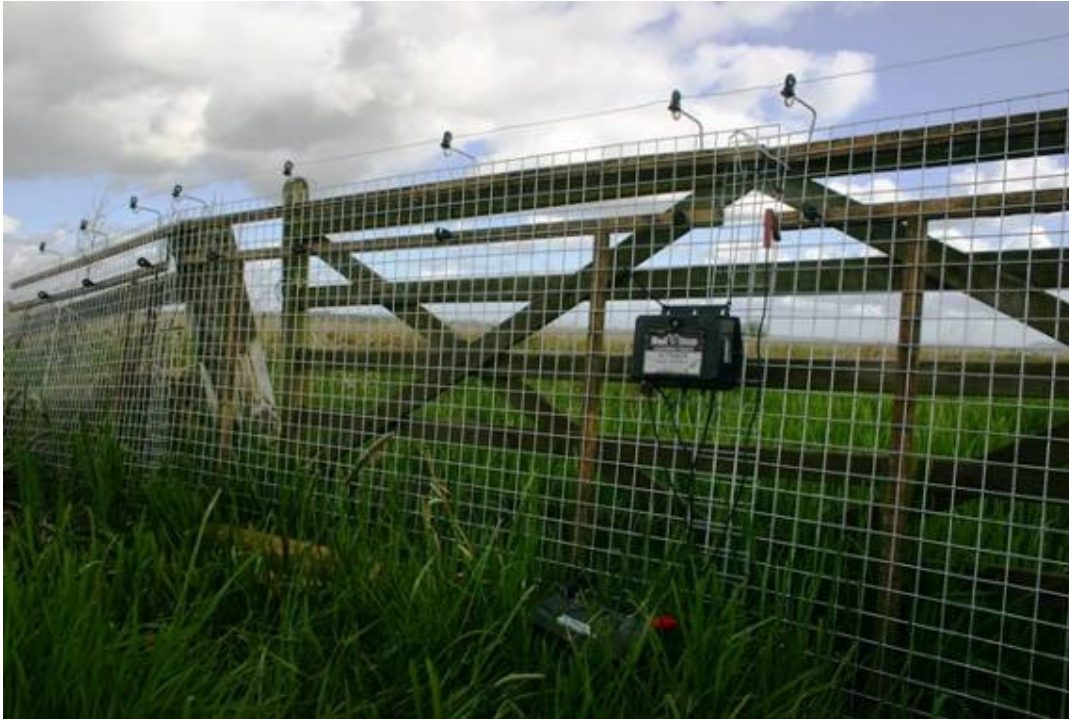
3. Fox deterrent fencing erected on only gateway to Legend and Elle's nest site.