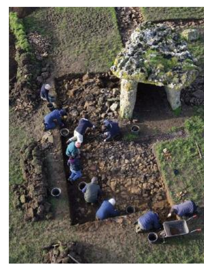
Community archaeology projects — like this one at St Lythans in the Vale of Glamorgan — help enagage local communities with their heritage.

Strategic partnerships have also been forged between Cadw, National Museum Wales, the National Trust and Arts Council Wales and beyond Wales with the other Home Countries. We will seek to enter into a formal agreement with the Scottish Government to exchange ideas, good practice and staff development opportunities in the historic environment sector. We will need to forge further strategic partnerships to develop fresh ideas for service delivery and to maximise opportunities for income generation and to bid for additional resources such as EU and Lottery funding.