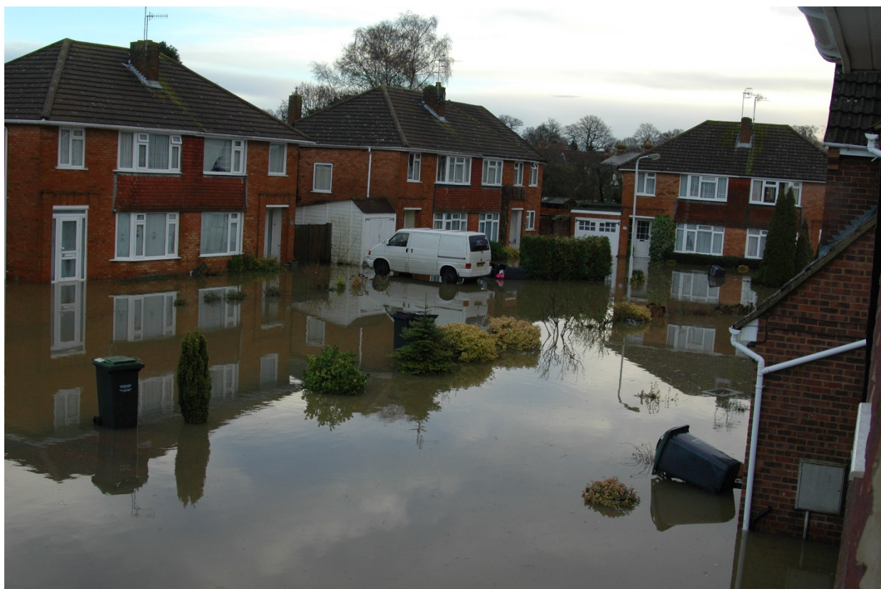
Above: Bramble Close, Hildenborough. Christmas Day 2013