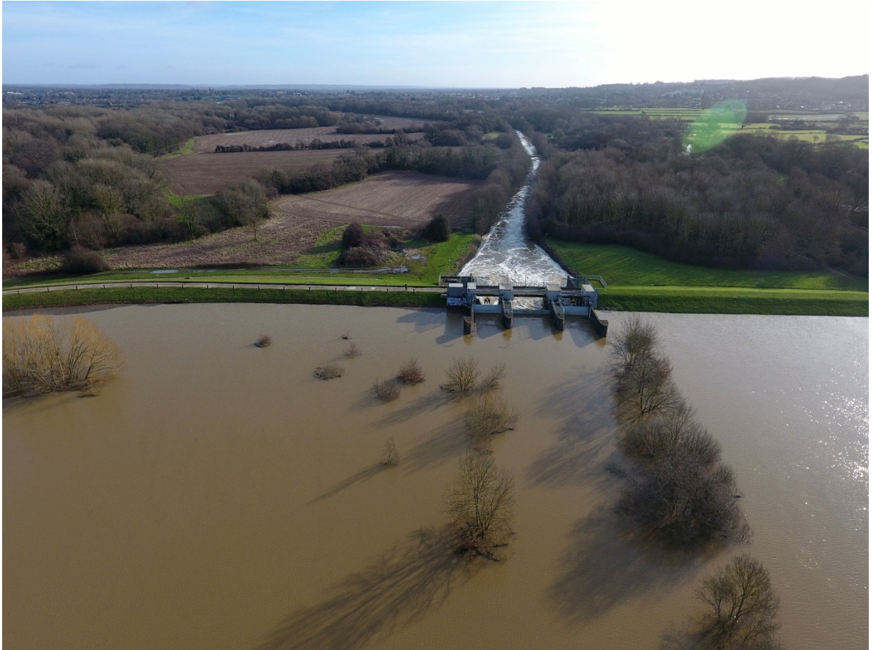
Above: Leigh FSA impounding flood water, 18 February 2020