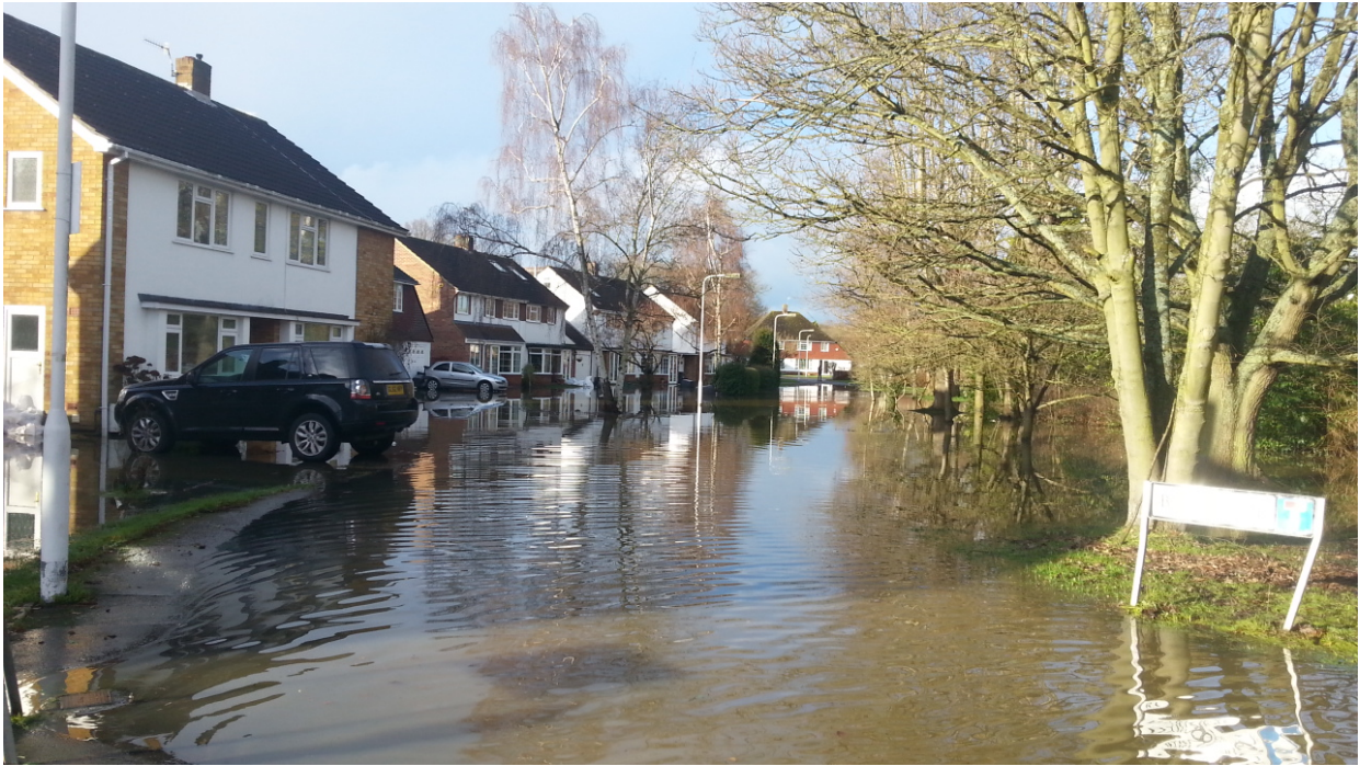
Above: Burnside, Hildenborough. Christmas Day 2013