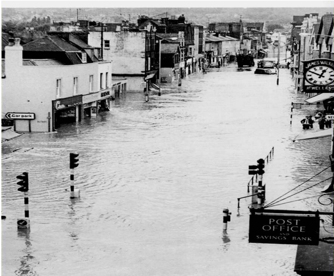
Above Tonbridge High Street, September 1968