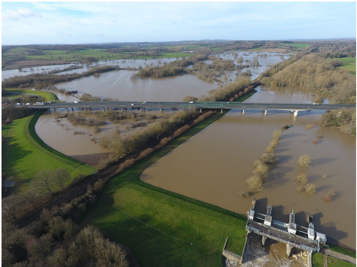
Above and below: Leigh FSA impounding flood water, 18 February 2020