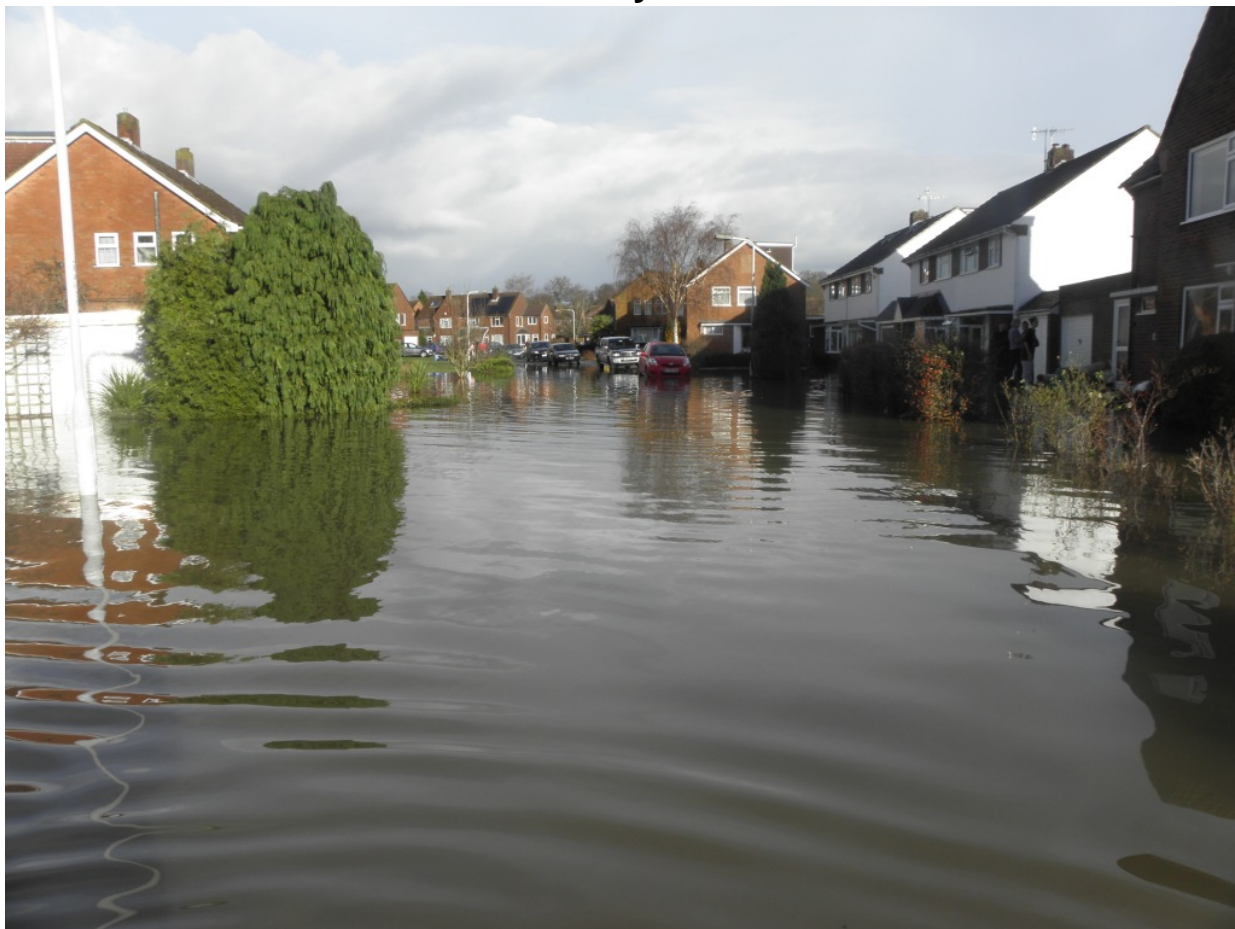
Above: Elm Grove, Hildenborough. Christmas Day 2013