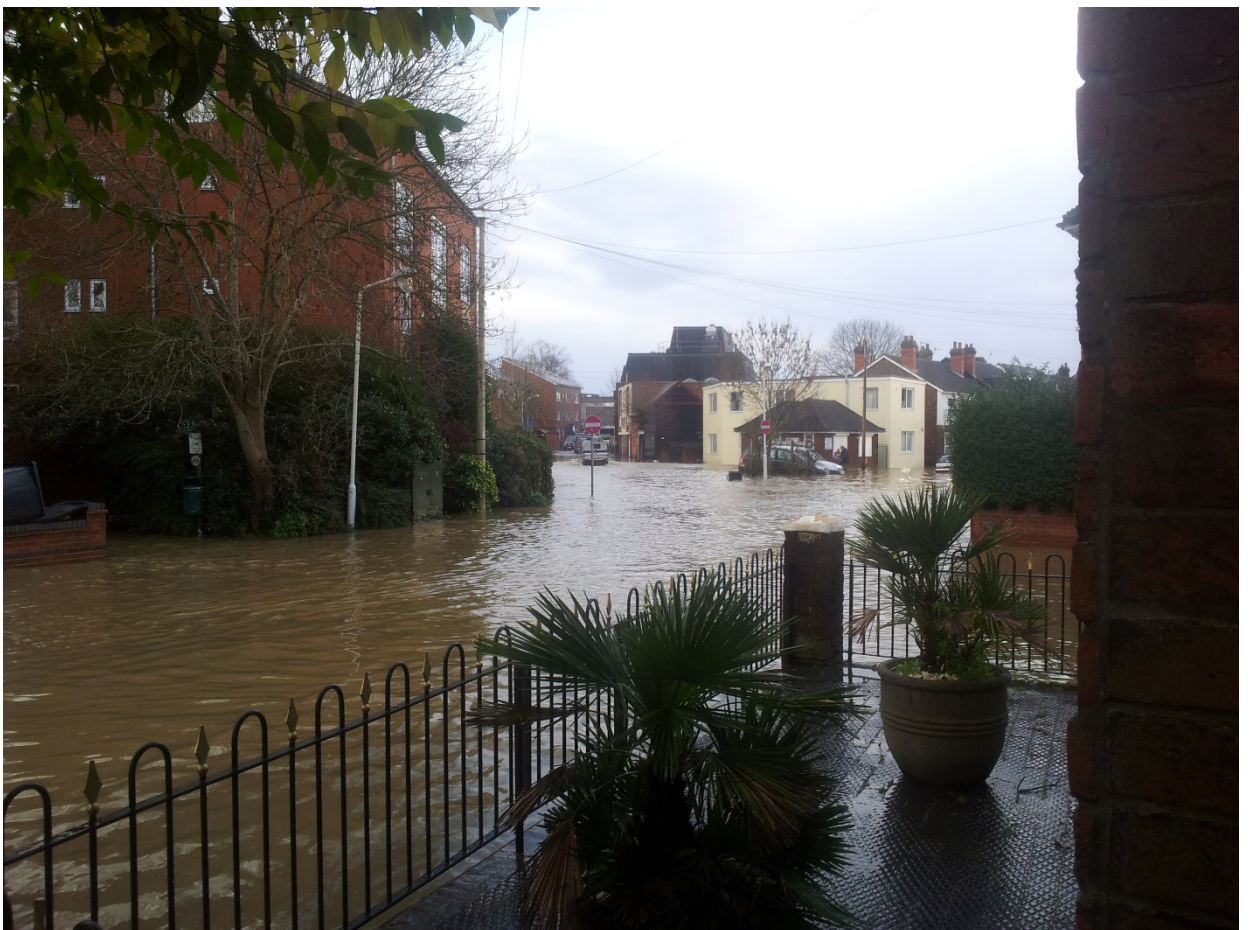
Above: Barden Road/Avebury Avenue, Tonbridge. Christmas Day 2013