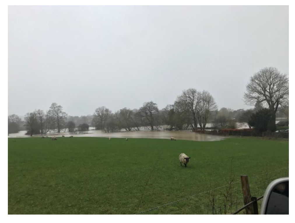
Figure 4: Flooding of the fields immediately upstream of Rogues Hill, 12:51 on 16 February 2020

The next two photographs (Figures 4 and 5) were taken from Rogues Hill on 16 February 2020. Figure 4 shows the fields immediately upstream of Rogues Hill and was taken at 12:51. Figure 5 was taken from the bridge on Rogues Hill over the River Medway and shows Bridge House. It was taken at 13:13. Impoundment of the FSA didn't begin until 17:15 the same day.