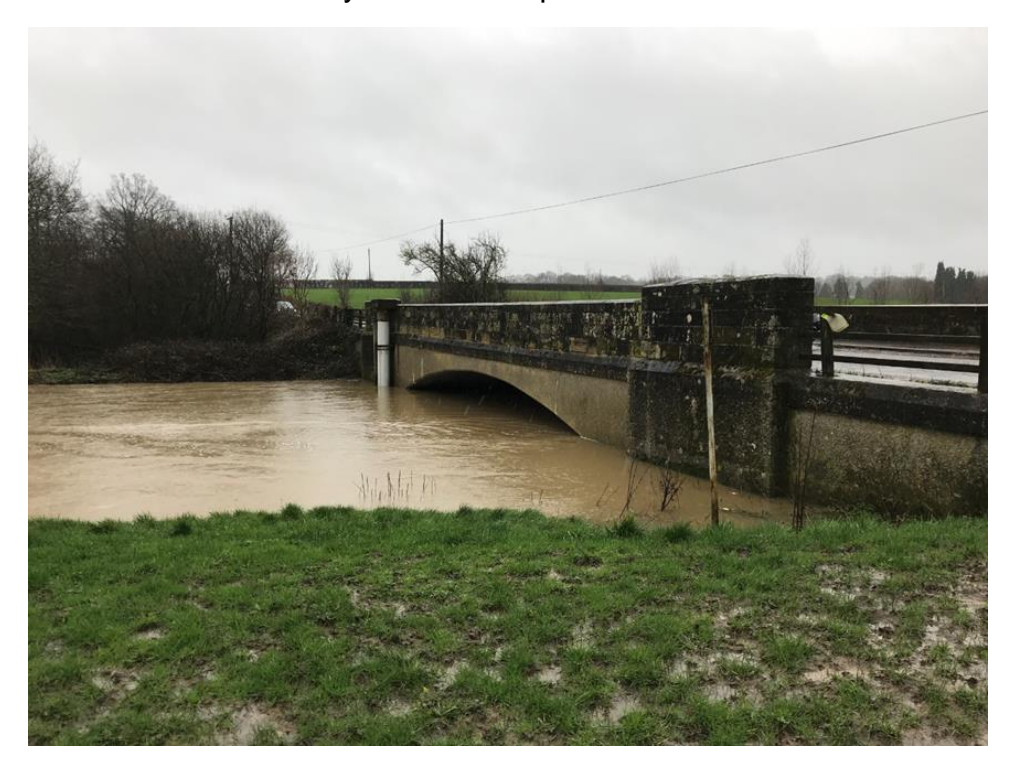
Figure 6: The bridge on Ensfield Road over the River Medway, 12:37 on 16 February 2020

The final photograph (Figure 6), below, was taken 14 minutes earlier than Figure 4 (at 12:37 on 16 February 2020). It shows the bridge on Ensfield Road over the River Medway, 3.9km downstream of Penshurst. It is clear that the river was within bank at this location whilst at the same time there was significant flooding in Penshurst driven by upstream flows. The FSA was not in operation and all the flooding at this time in Penshurst was driven by flows from upstream.