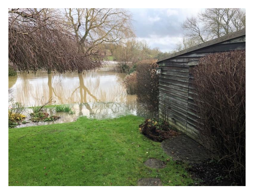
Figure 3: Flooding of the garden of Colquhouns Cottage, 14:12 on 20 December 2019

The next two photographs (Figures 4 and 5) were taken from Rogues Hill on 16 February 2020. Figure 4 shows the fields immediately upstream of Rogues Hill and was taken at 12:51. Figure 5 was taken from the bridge on Rogues Hill over the River Medway and shows Bridge House. It was taken at 13:13. Impoundment of the FSA didn't begin until 17:15 the same day.