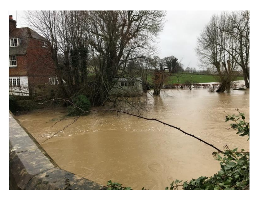
Figure 5: River Medway and Bridge House, 13:13 on 16 February 2020

The final photograph (Figure 6), below, was taken 14 minutes earlier than Figure 4 (at 12:37 on 16 February 2020). It shows the bridge on Ensfield Road over the River Medway, 3.9km downstream of Penshurst. It is clear that the river was within bank at this location whilst at the same time there was significant flooding in Penshurst driven by upstream flows. The FSA was not in operation and all the flooding at this time in Penshurst was driven by flows from upstream.