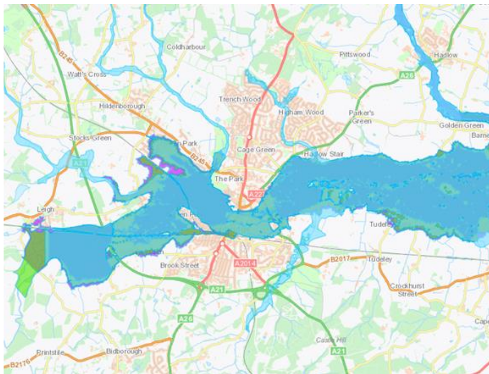
Map showing extent of Flood Zone 3 in an around Tonbridge and Hildenborough

Tonbridge & Malling Borough Council is at a key stage in the development of the Local Plan. Work is being undertaken to identify a supply of sites that will meet the housing and employment needs of the borough up to 2031. However, there are significant parts of the borough that fall within the flood zone and, without any new works being undertaken, will not only continue to put existing homes and businesses at risk but also prevent sites coming forward for much needed new development growth in strategically important areas.