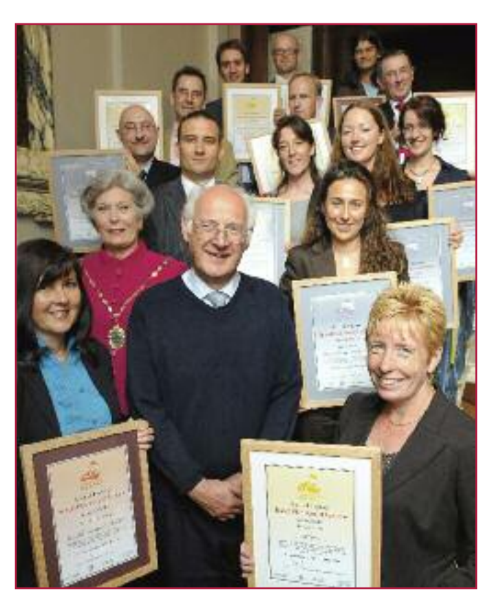
The West of England Travel Plan Awards recognises and rewards employers and organisations for their efforts in developing a Travel Plan. Contact North Somerset Council's Travel Plan Coordinator if you wish to apply.

3.3.10 Therefore any Planning Obligation must include mechanisms and staged measures to ensure that any failure to deliver the measures and outcomes set out in the Travel Plan can be remedied. A range of approaches may be contemplated and Box 3.1 below identifies a non-exhaustive list of those that may be considered for inclusion in the Planning Obligation. It should be stressed that any payments should be by way of impact (mitigation) charges, are not a penalty, and simply represent a suitable means of addressing any shortcomings in delivery.