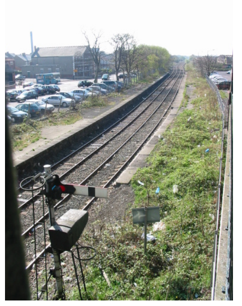
Former Ashington Station

6.43 The South East Northumberland Public Transport Corridor aims to improve public transport services and infrastructure along the inter-urban corridor between South East Northumberland and the Tyne and Wear City-Region. The key urban areas of development will be linked by direct passenger rail services on the existing Ashington, Blyth & Tyne rail freight line. These services will be integrated with the local bus networks. Type & Wear Metro network at Northumberland Park and pedestrian and cycle routes at new or refurbished station interchanges. Facilities will be provided for bus interchange, park and ride, passenger waiting, passenger information and appropriate access for all. The line will also be integrated with the Stephenson Link to improve access jobs in North Tyneside.