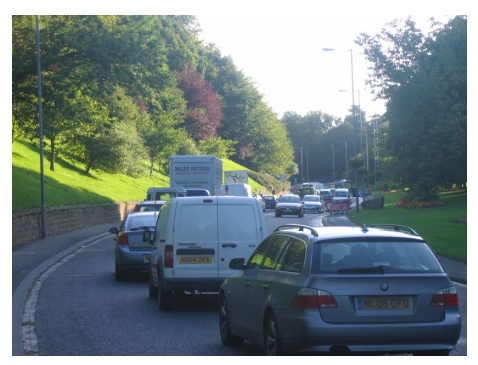
Congestion on the approach to Telford Bridge, Morpeth