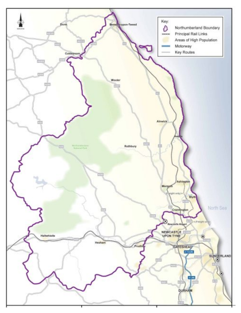
Figure 3.1 Northumberland Area

and Wales with 27% of residents aged over 60 years old. The population is set to get older, with people over 55 making up a much higher proportion of the total population in 2021 than they did in 2006. This change will be particularly marked in rural areas. The County is predicted to have a higher proportion of over 85s than the English average. This will place additional strain on the county's infrastructure as more people require health and social care on a regular basis.