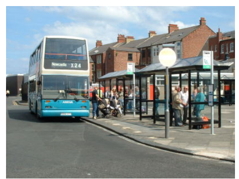
Blyth Bus Station

6.25 Bus travel is the main mode of public transport in Northumberland, accounting for 6% of all journeys to work in 2001. The economic use of road space and ability to carry large numbers of passengers means that bus travel can play a significant role in managing the forecast increase in traffic growth and improving access to key services and facilities in urban areas. The provision of frequent and reliable bus services and high quality facilities is essential for encouraging motorists out of their cars. However, the dispersed nature of