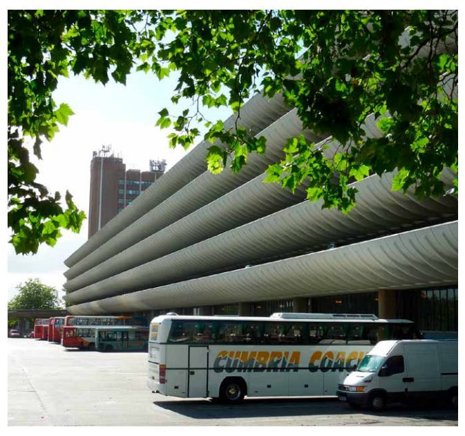
Figure 12 Preston Bus Station and multi-storey car park, designed in 1969 by BDP Building Design Partnership (Keith Ingham project architect). The curving balustrades of the car-park create a monumental backdrop for the dynamic concrete ramps. Listed Grade II.

at Newcastle-upon-Tyne, of 1901). Such offices were often emblems of civic pride and designed at considerable expense. Shelters varied from being modest standardised cast-iron structures, as at Elms Road, Dover (Grade II listed) to more substantial civic buildings such as the matching pair of Free Baroque pavilions with copper domes at Darwen, Lancashire of 1902 (Grade II listed). Like depots they tended to move seamlessly from tram to bus operation and only the generating stations became redundant. Electric generating stations themselves, dating from the 1880s onwards, are rare, as are early tram shelters. Many tram depots survived as bus garages until recent years but are now very vulnerable, whilst tram shelters moved seamlessly into use for bus operation as at Brighton, East Sussex, where examples include the listed International style shelters of 1926 designed by the Borough Engineer, David Edwards.