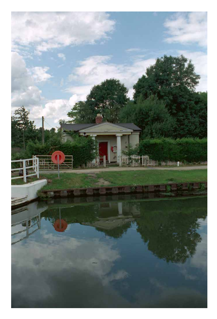
Figure 1 Bridgekeeper's House, Fretherne Bridge, Fretherne, Gloucestershire. One of a series of classically-inspired houses along the Gloucester-Sharpness canal of the early nineteenth century. Probably designed by Robert Mylne who had acted as Surveyor to the company in 1793. A high degree of architectural interest and individuality is given to what is more usually an unremarkable building type. Listed Grade II.

the Great Western Railway from London to Bristol in 1841. The second phase runs from 1841 to 1850, and marks the heroic age of railway building and the period of 'railway mania' in which commercial speculation and the competition for routes led to the frantic construction of lines, including the Great North Railway and the laying of many of the main trunk lines that form the basis of today's inter-city network. The third phase, from the 1850s to the 1870s, saw the consolidation of the network including the opening of the dramatic Settle to Carlisle line, carrying the Midland Railway into Scotland.