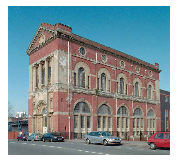
Figure 11 Tramway generating station, Counterslip Street, Bristol. Designed for the Bristol Tramways and Carriage Company in 1899 by W. Curtis Green. Such functional buildings were nonetheless conceived of as civic architecture and were a positive addition to the cityscape. Green went on to design similar structures in Hove and Chiswick. It has now been converted successfully to offices. Listed Grade II*.