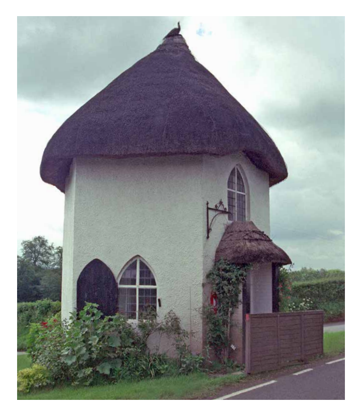
Figure 7 The Round House, Stanton Drew, Somerset. A particularly picturesque thatched former toll house of the eighteenth century designed for a turnpike trust. As was normal, its ground plan was designed to give a clear view of approaching traffic from its canted bays. Listed Grade II.

These are often distinguished by half-polygonal ends giving views in each direction. Although cottagey in scale, they come in a variety of styles and have more in common with polite than vernacular architecture (Fig 7). Most tollhouses, especially as they will pre-date 1850, will be serious candidates for listing where they have survived with little alteration. Original interiors