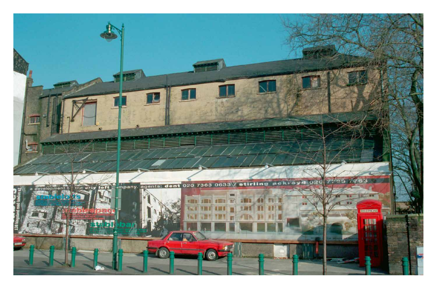
Figure 8 A rare survivor of the days of the horse-drawn tram in London. This stable-block in Kingsland Road, Hackney, has a cobbled ramp to connect its four storeys. Listed Grade II.

mangers for feeding, with provision for storing saddlery, and with easily-draining floors to facilitate cleaning; accommodation for grooms was often placed at first floor level, alongside storage for hay and straw. Given the prized status sometimes accorded to horses, some stables were very elaborate architectural affairs indeed. Commercial stabling for transport horses was common on industrial sites and at some coaching inns. Victorian commercial enterprises such as the Co-operative Societies and transport companies (in particular, railway companies) sometimes constructed vast stables, sometimes on several levels, connected by gently sloping ramps (Fig 8). The disappearance of horse transport from the street scene has been one of the most marked changes of the post-First World War period. Commercial stables are rare survivals, especially in urban contexts, and judgment as to their