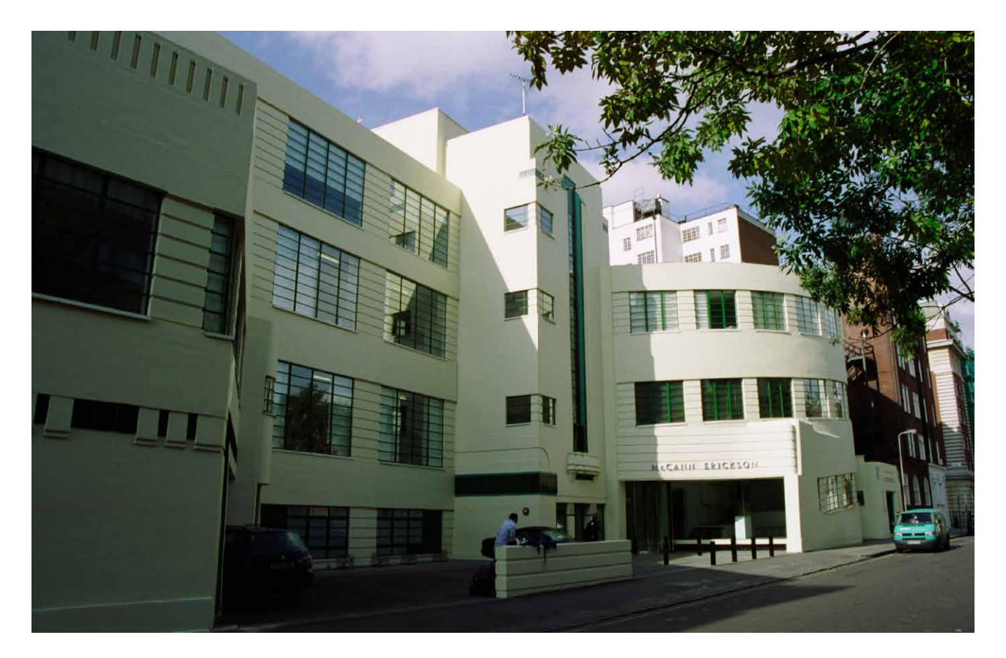
Figure 9 A striking multi-storey car park for the Daimler Company in Herbrand Street, London Borough of Camden, designed by Wallis, Gilbert and Partners in 1931. The building's functionalism is conveyed by the use of the

Modern Movement style. Daimler-owned cars were stored to the upper floors whilst the lower floors were used as a car park, with waiting rooms, attendant's office, lavatories and telephones. Listed Grade II.