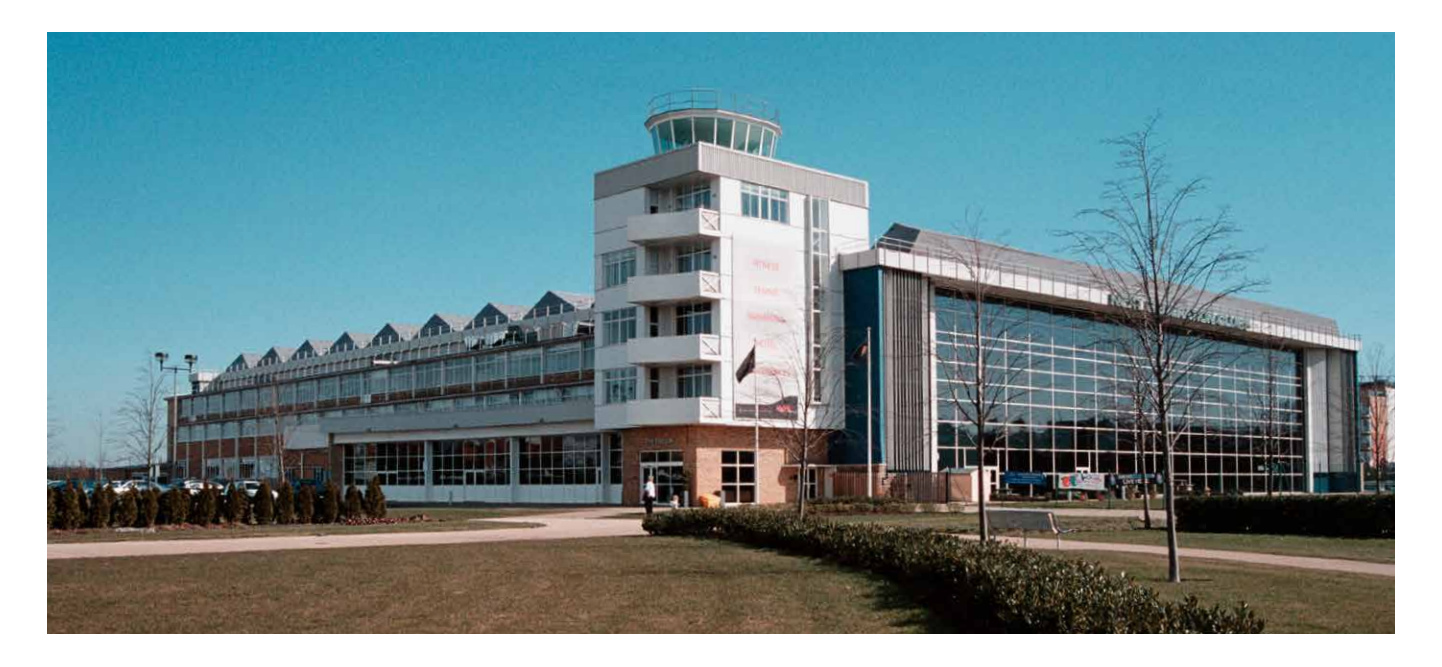
Figure 14 The flight test hangar, offices, fire station, and control tower, British Aerospace, Comet Way, Hatfield, Hertfordshire. A complex built for the world's first jetairliner, the De Havilland Comet, by James M Monro

and Son with Structural and Mechanical Development