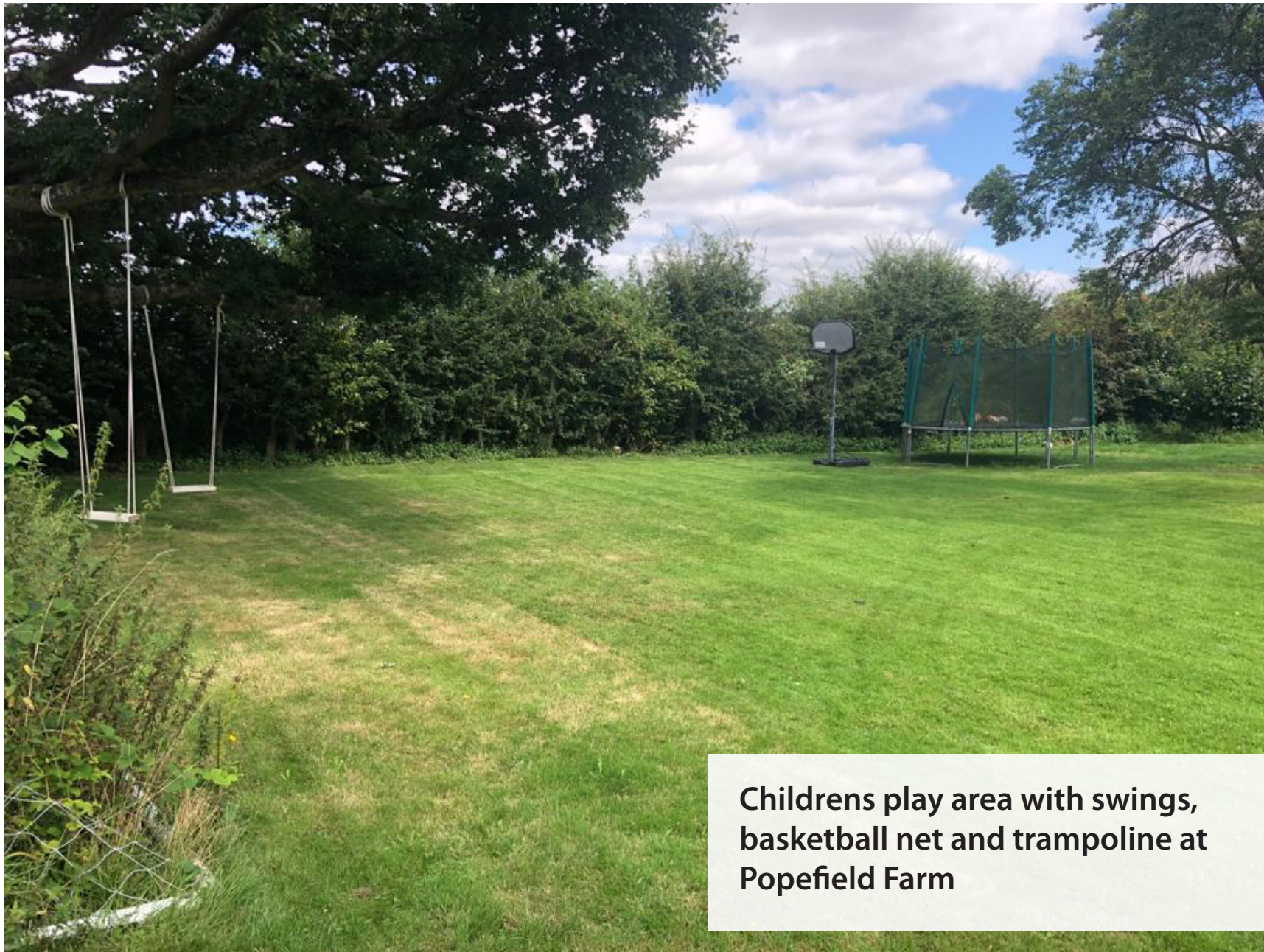
Childrens play area with swings, basketball net and trampoline at Popefield Farm