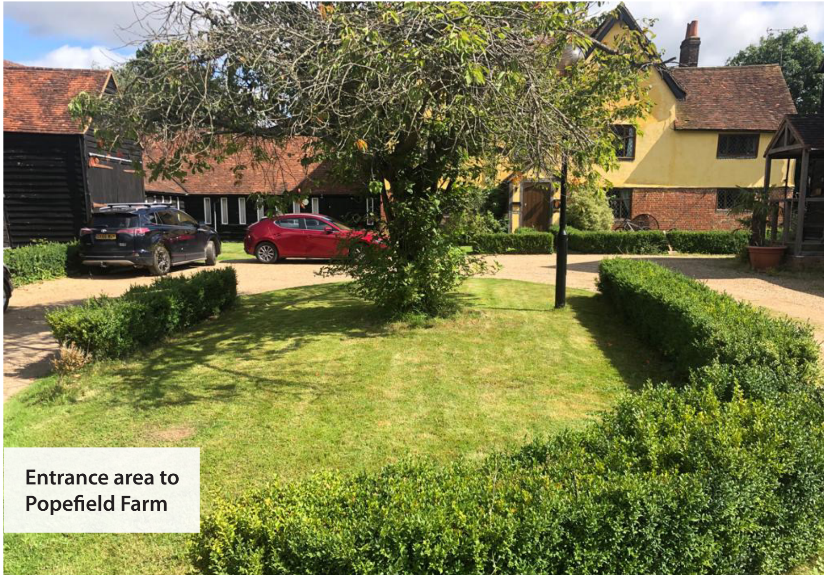
Entrance area to Popefield Farm

You can see from the photos how tranquil, peaceful and well maintained Popefield Farm is for all the residents and business.