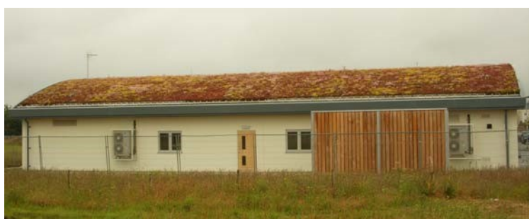
Orchard Park Community Centre