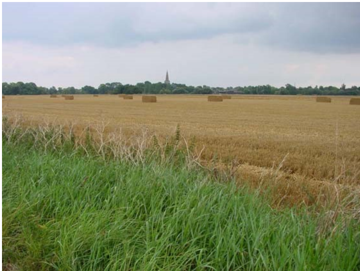
The Fens Natural Area looking towards Over.