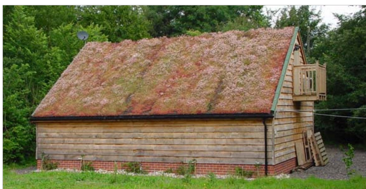
A private building using green roof techniques to lessen the visual impact.

The District Council shall adopt the following approach: