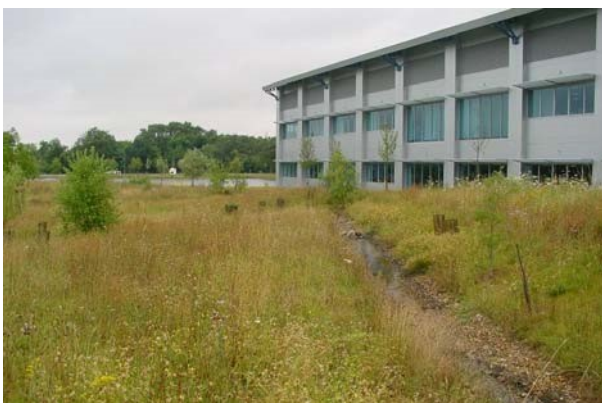
The use of ditches and wildflower meadows softens the impact of hi-tech office buildings at Granta Park.