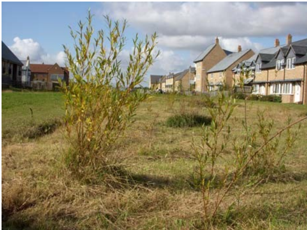
The creation of this osier greenway at Cambourne brings distinctive design, open space and biodiversity gain to the housing estate.