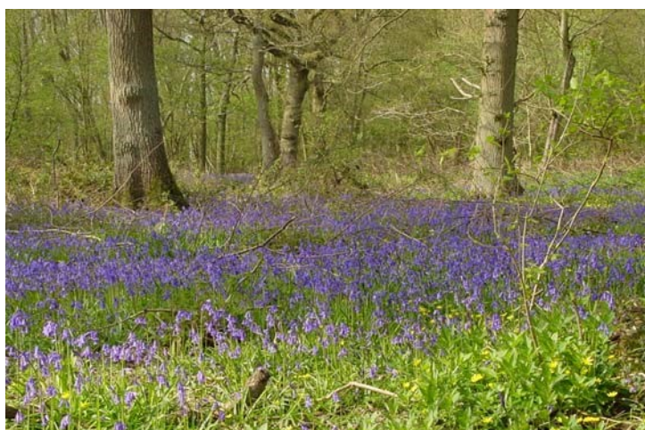
The West Anglian Plain Natural Area contains a number of ancient woodlands such as Hayley Wood.