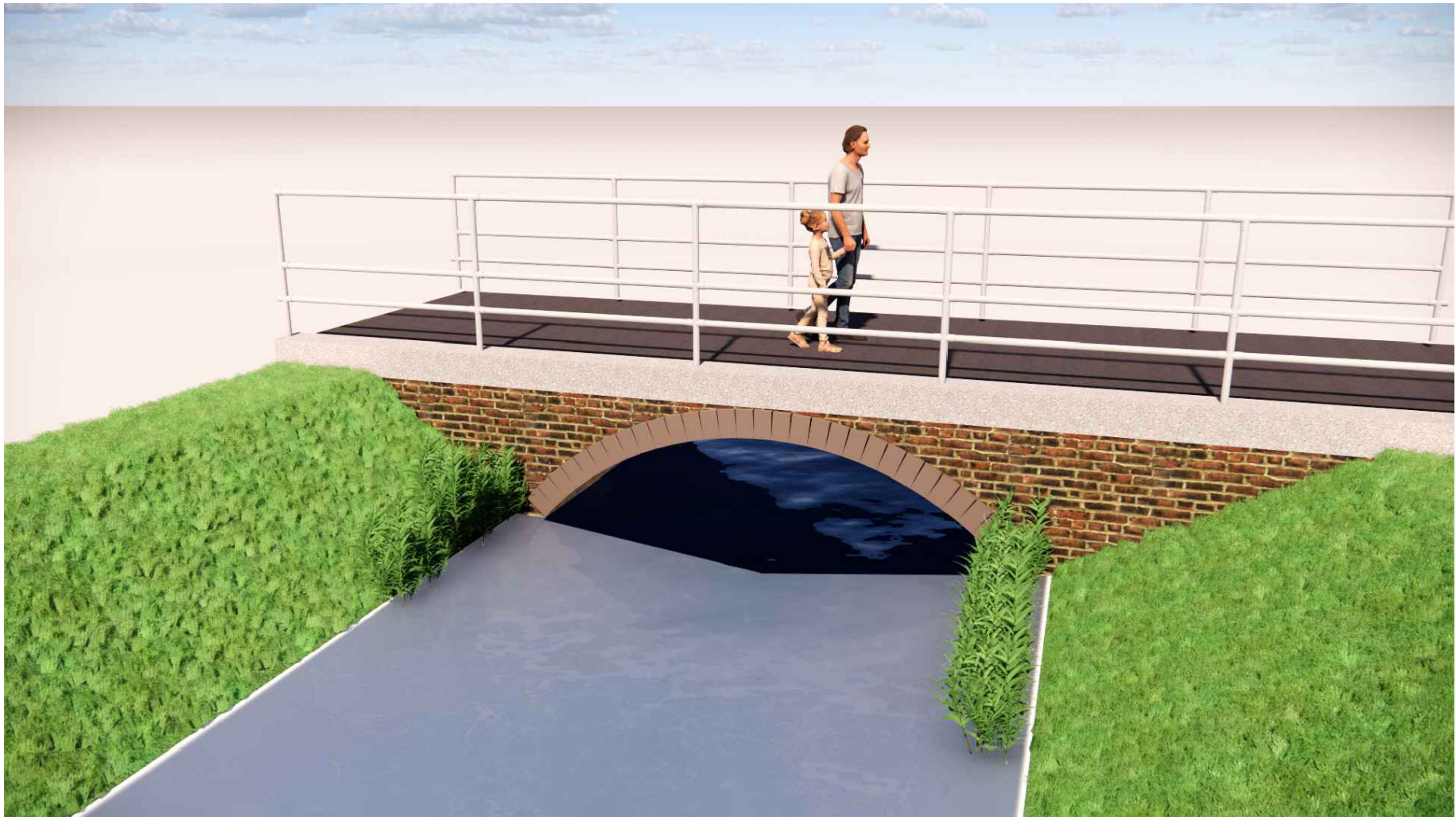
3m WIDE CYCLEWAY BUILT ON EXISTING BRICK CULVERT WITH 1.2m HIGH METAL HANDRAIL