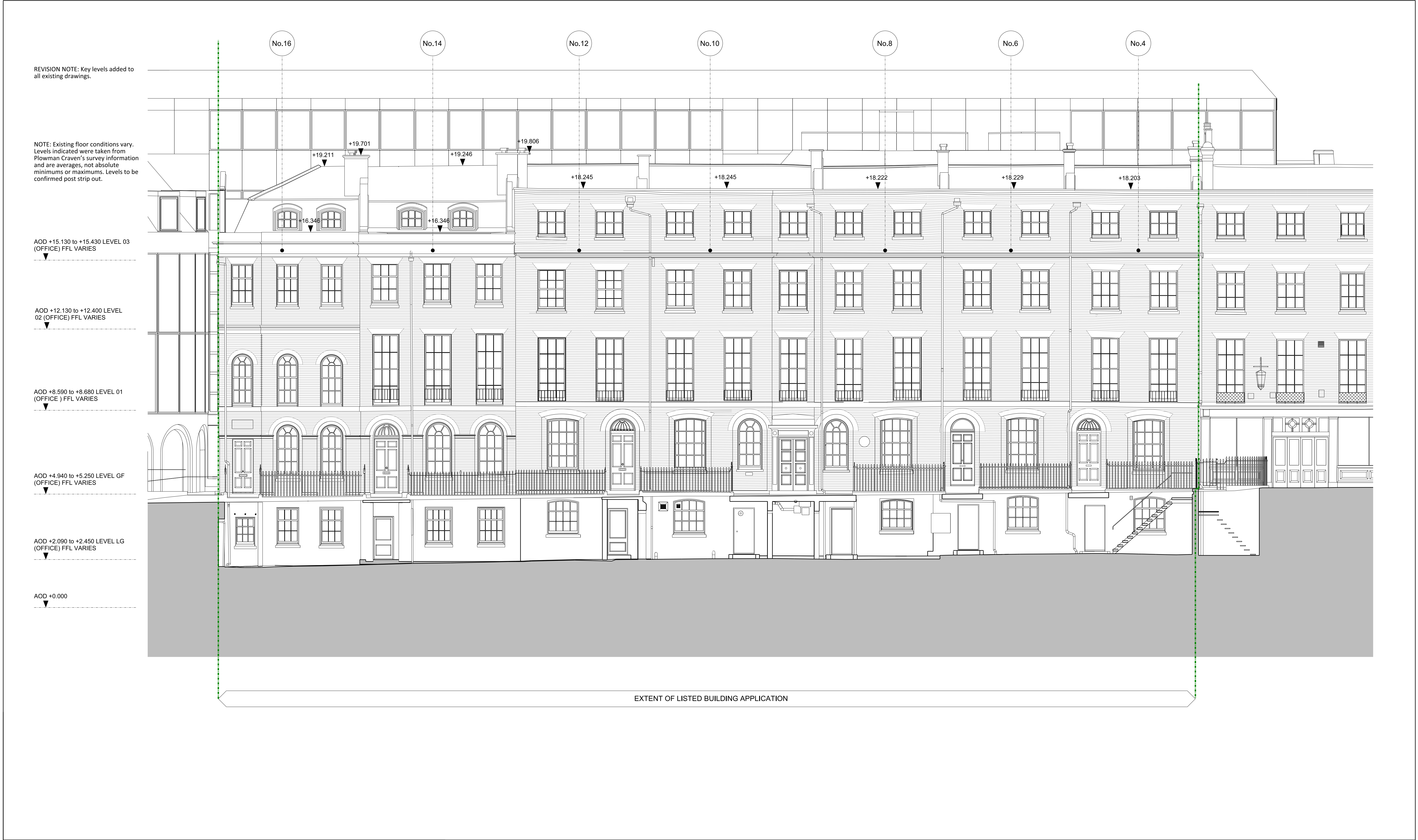
01 EXISTING NORTH ELEVATION