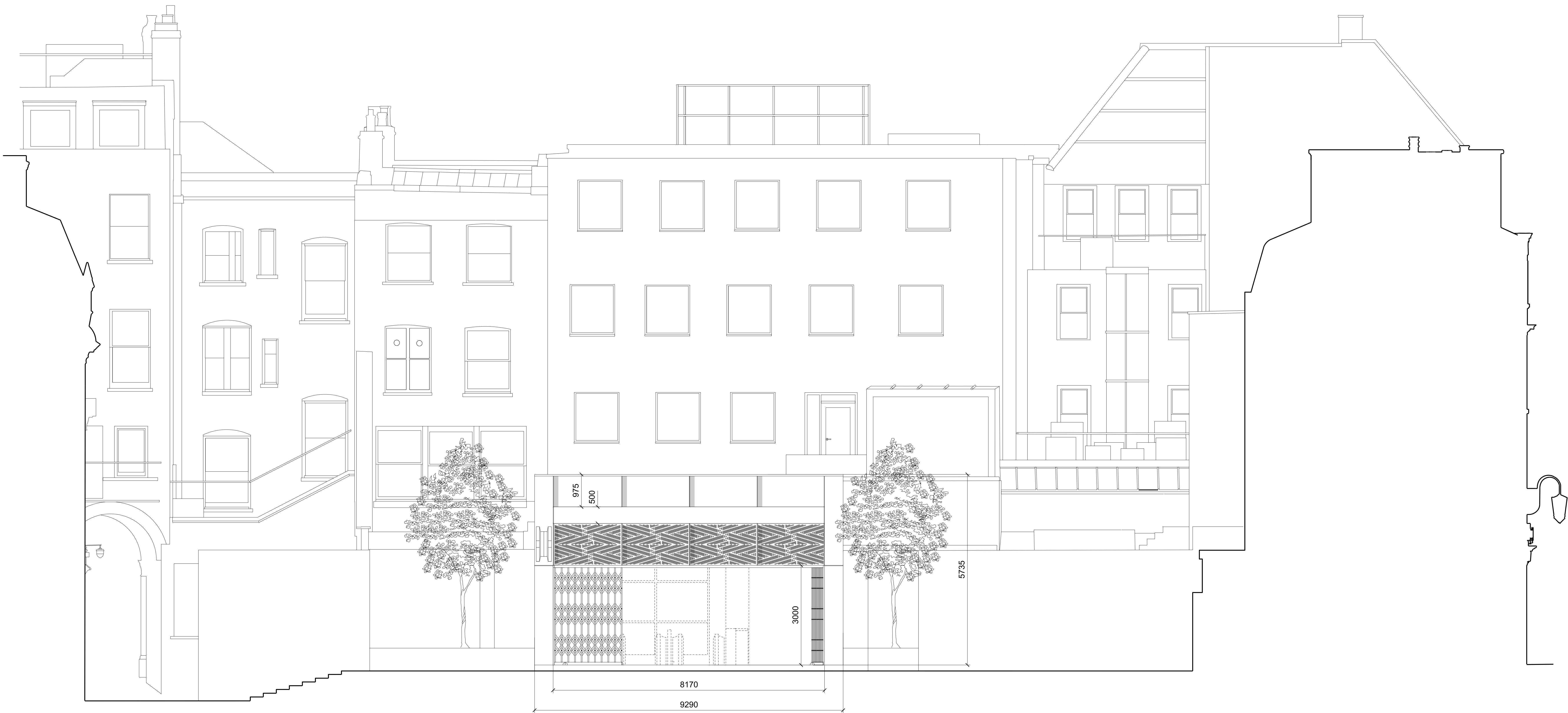
02 LUL PROPOSED TUBE STATION ELEVATION