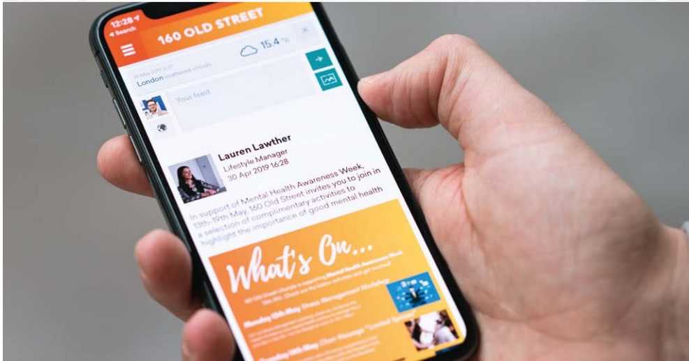
Top: The Hickman, E1