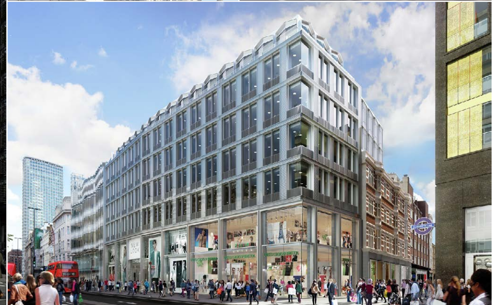
33 Margaret Street, W1 73-89 Oxford Street, W1