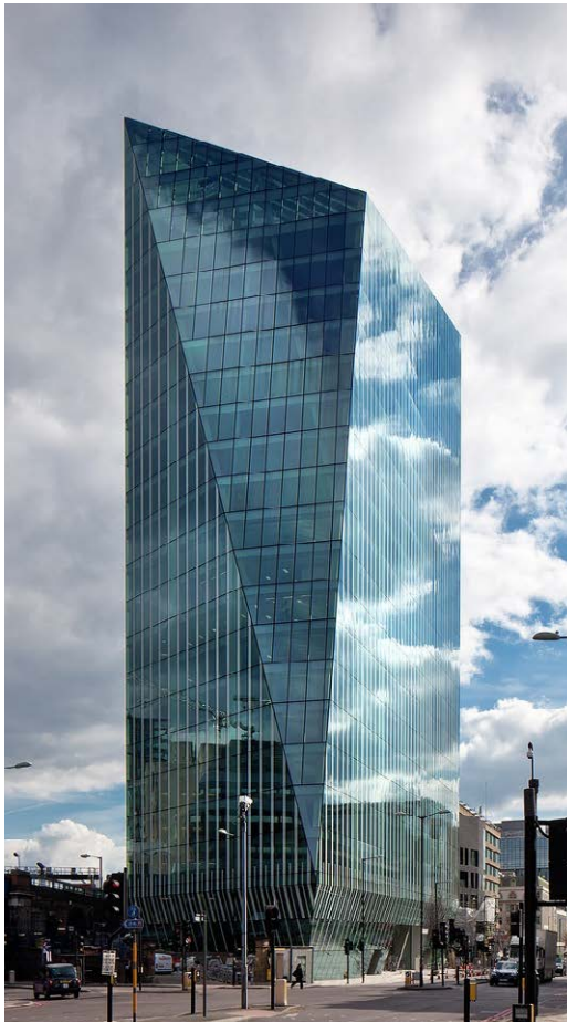
240 Blackfriars Road, SE1

Over the past decade we have created a wide variety of workplaces that are appropriate for their location – the diversity of design, which is always of the highest quality, has created space that allows London to thrive.