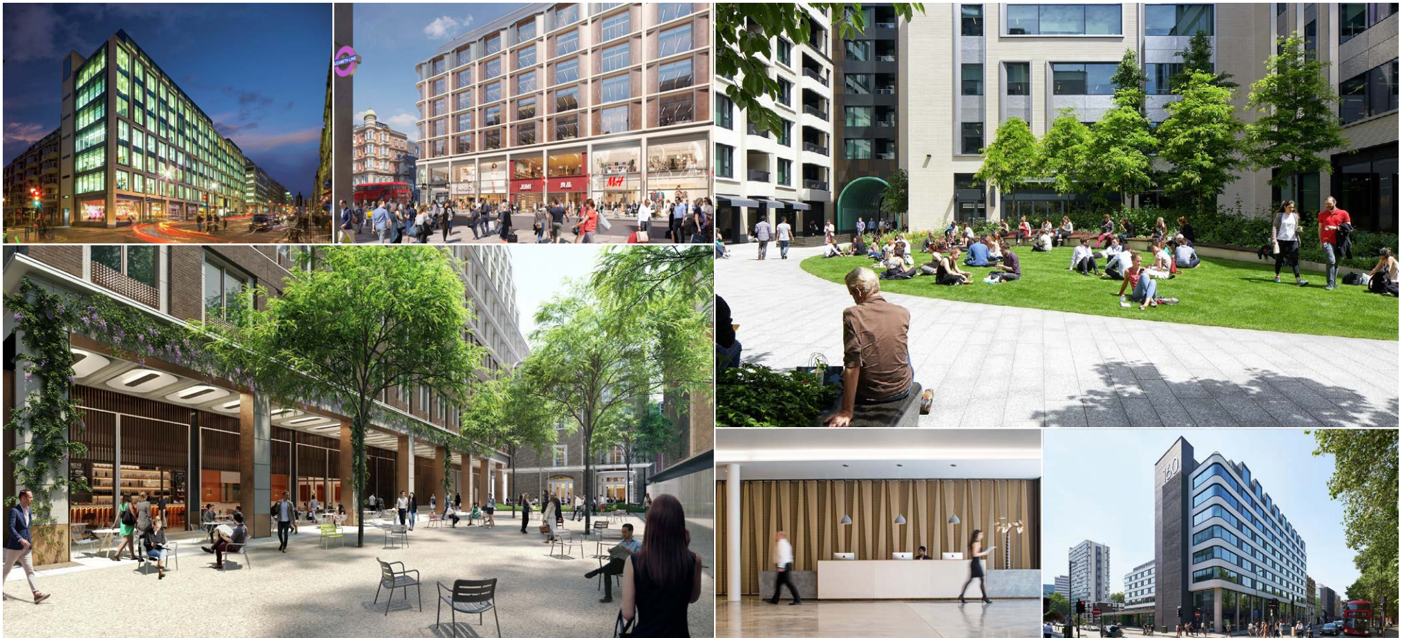
95 Wigmore Street, W1 Hanover, W1