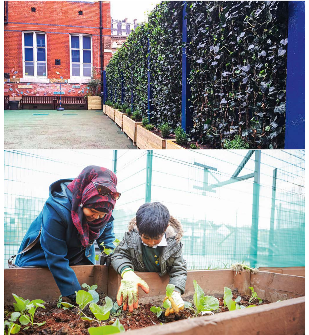
Top: Green screen at Oliver Goldsmith School in Southwark

Considering improvements that positively impact on community, health and wellbeing