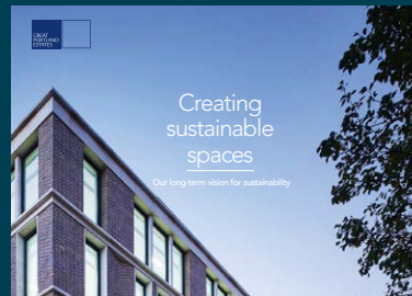
Our long-term vision for sustainability