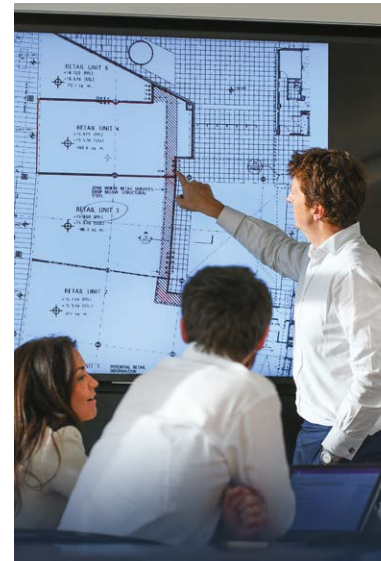
GPE team reviews plans for a future development

Being forward thinking, energetic and bold in our decision-making