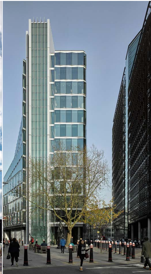
12-14 New Fetter Lane, EC4