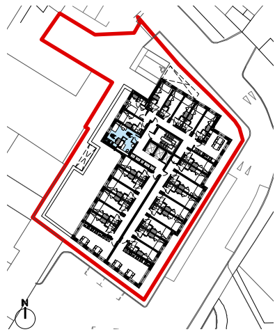
2nd - 13th floor