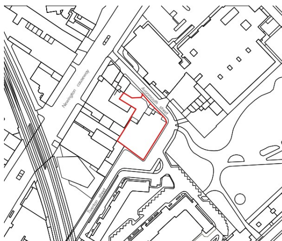
Figure 1: Site Location Plan

2.2 The site is located within the Chaucer ward. The site is accessed from the southern and western side of Avonmouth Street, approximately 50 metres from the Newington Causeway (A3) junction. An extract from the Site Location Plan is provided below.