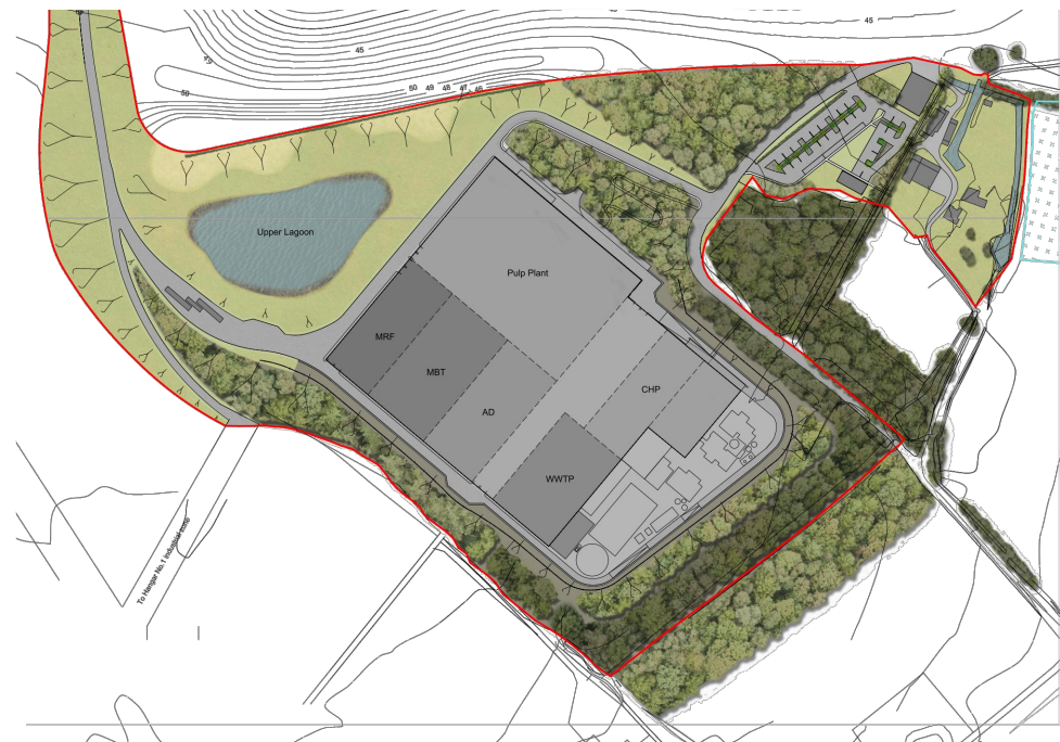
Site Plan not to scale