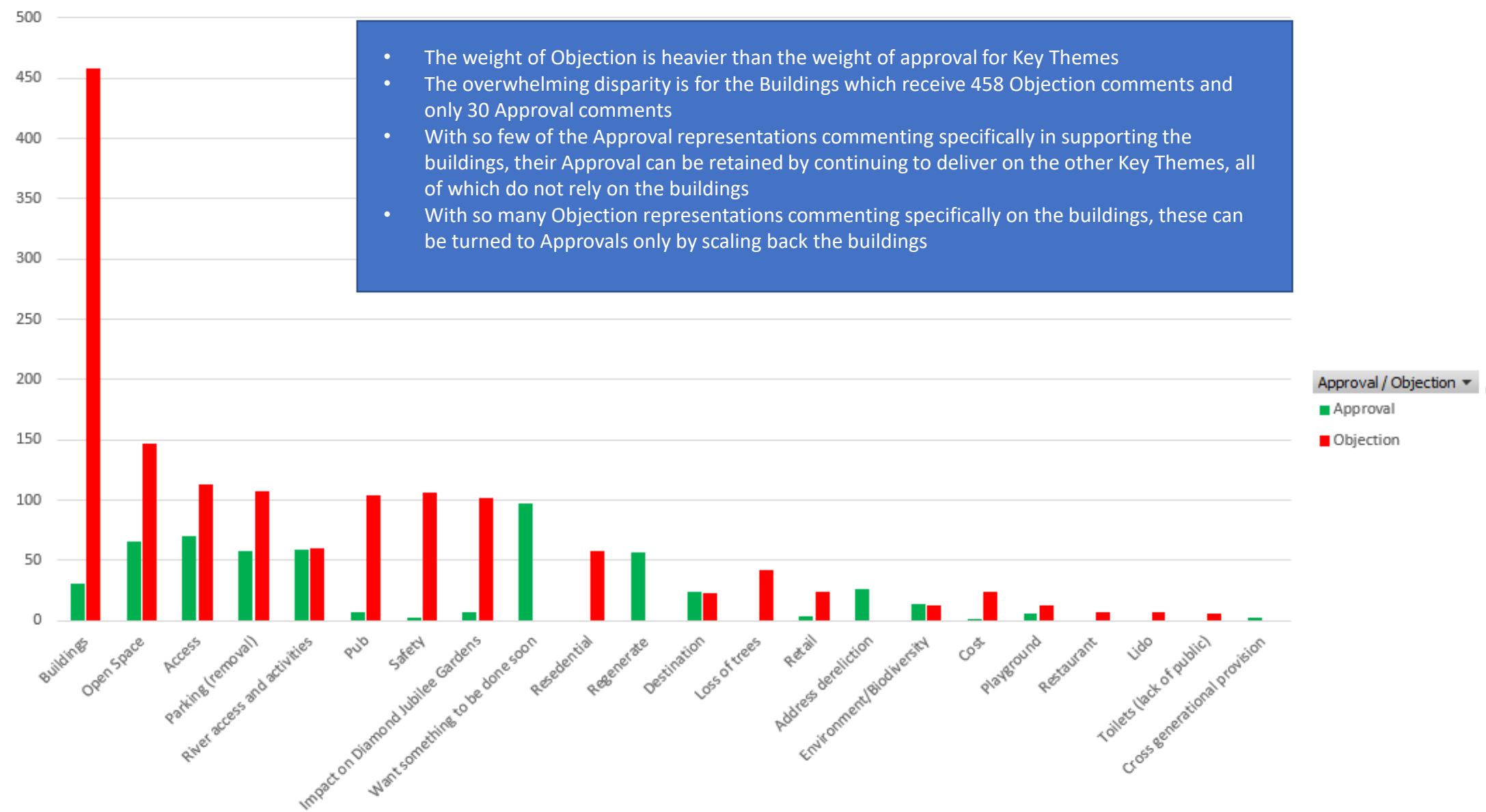
Comparison of Approval vs Objection comments for Key Themes