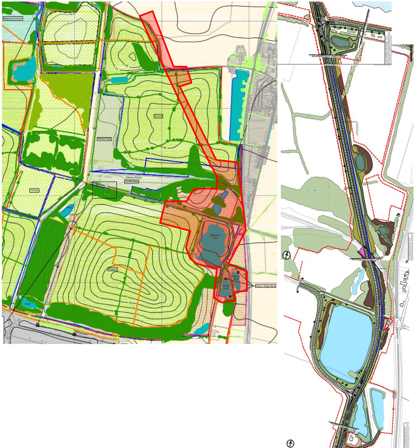
Figure 3: Extracts from drawing 427R220F Rev F and Landscape GA Sheets 9 and 10

construction phase and will be returned to FCC for restoration in accordance with their approved restoration plan.