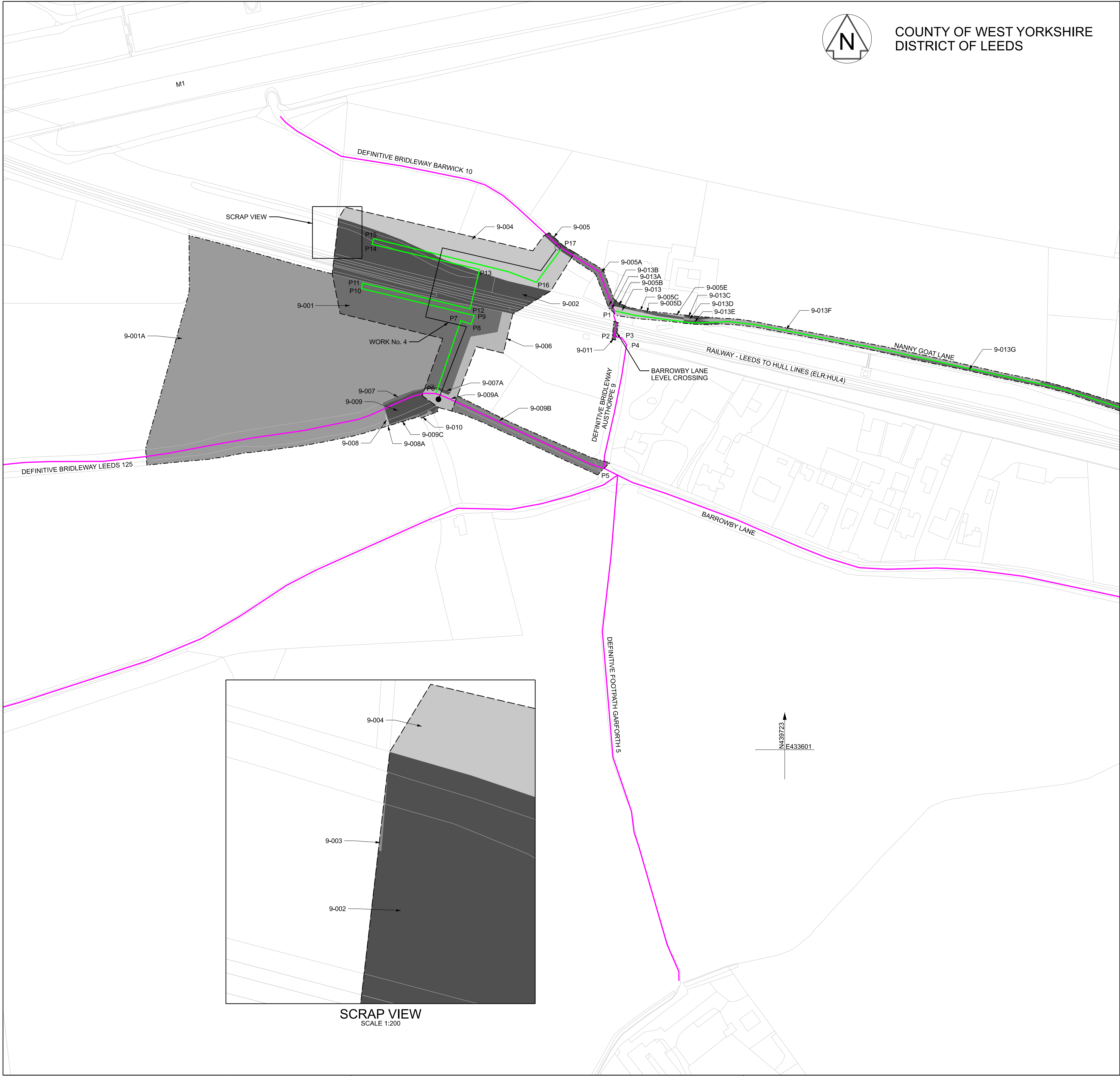
SCRAP VIEW SCALE 1:200