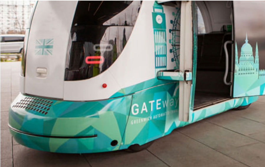
Photo: Gateway Project Potential for the future integration of autonomous vehicles and overhead transport systems into the Garden Line will be explored further.