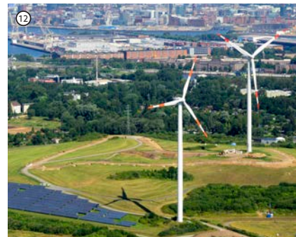
Energy Hill, Wilhelmsburg, Germany - reuse of a landfill site