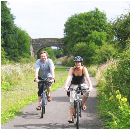
The Garden Line - generous high quality cycle infrastructure in a rural setting