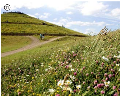
Northala Fields, Northolt, Greater London