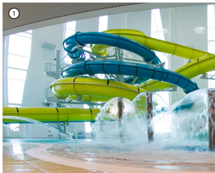
Haven Point Leisure Centre, Newcastle upon Tyne