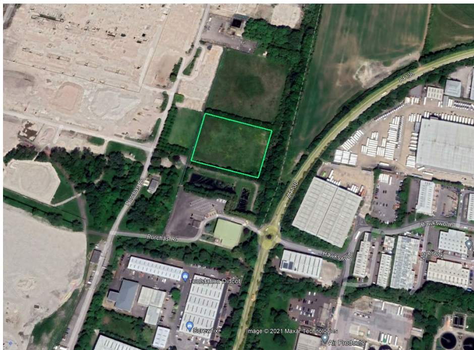
Figure 2: Google Earth Imagery Dated September 2021

It is only when Google Earth Imagery from January 2010 is viewed that it is possible to see that the existing field was previously used as a football pitch. This correlates with information obtained from RWE that the playing field has not been used in 11 years – see Appendix A .