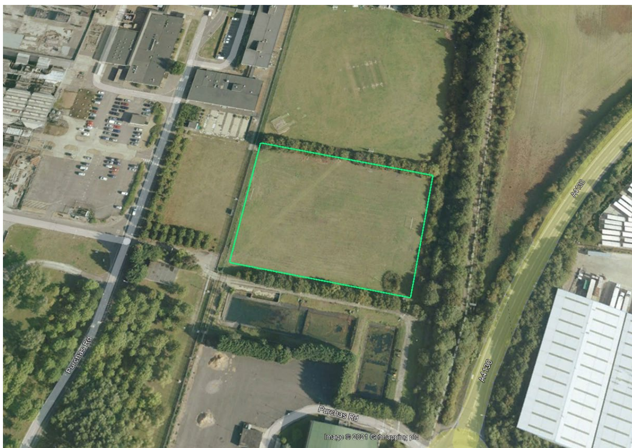
Figure 3: Google Earth Imagery Dated January 2010

It is only when Google Earth Imagery from January 2010 is viewed that it is possible to see that the existing field was previously used as a football pitch. This correlates with information obtained from RWE that the playing field has not been used in 11 years – see Appendix A .